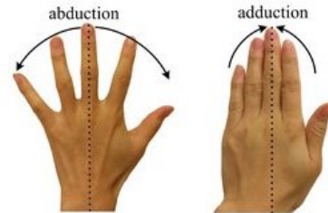
Fig. 2: Adduction and Abduction of the palm [13]

An Adduction refers to the movement of a limb or other part towards the mid-line of the body. On the contrary, an Abduction is a limb's movement away from the body's mid-line. Figure 2 shows the adduction and abduction of the palm.