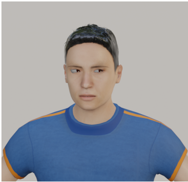
Fig. 4: AU 61(eye turn left) not implemented as morph since we already have look and lookat constraints in AZee

We choose not to include the action units which correspond to global dependencies. These include Action Units(AUs) 51 to 60, which correspond to head movements AUs 61 to 69, which correspond to eye movements.