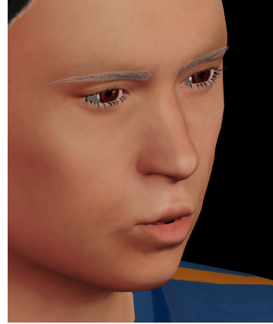
Fig. 5: Facial expression in rule :inter-subjectivity by combining AU18 and AU22