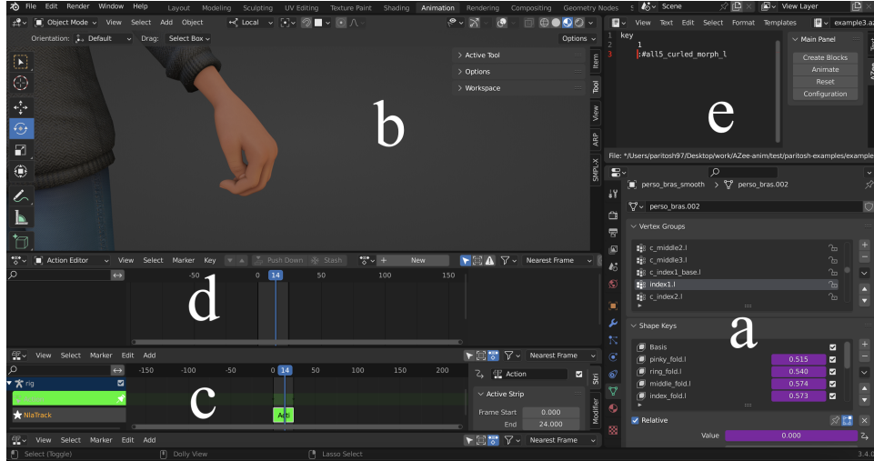
Fig. 6: Blender interface. (a) Shape Key properties (b) 3D Viewport (c) Non-linear Editor (d) Action Editor (e) AZee editor

morph support. Figure 6 shows the Blender interface configured with the new shape keys. Its main components include: