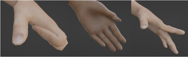
Fig. 1: Unnatural shape synthesis of the hand shapes using the kinematic model to generate hand shapes with AZee

Since the technique uses the skeleton space of the avatar, it often results in unnatural synthesized shapes, as shown in figure 1. Furthermore, with complex expressions, it is difficult for a linguist to write such code for a variety of hand shapes.