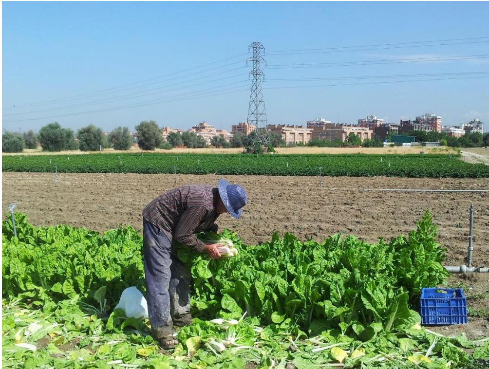
Figure 1. View of the Huerta of Fuenlabrada (Madrid Region). In the foreground, a farmer harvesting chard, a traditional and high quality crop in this city.

In 2012, the City Council of Fuenlabrada decided to develop an agrarian park by using a multifunctional, agroecological and participative approach. The aim was to preserve and strengthen professional agrarian activity, and drive specific programs to allow the development of the economic, environmental and landscape potential of the territory. Two years later, the Management and Development Plan of the Agrarian Park of Fuenlabrada was drafted (Figure 2). It was based on an exhaustive participative diagnostic document that identified the problems, needs and demands of the local agrarian sector and the peri-urban space in general. The document revealed the strengths and opportunities to drive the local, quality agri-food system forward. It was agreed that one of the keys to strengthening the identity of local production should be adding value to the landscape, which presented a challenge, as this was not an exceptional location like the large Spanish Huertas in Valencia, Murcia and Aranjuez, but an ordinary everyday landscape, ignored by the urban citizens. Therefore, it was