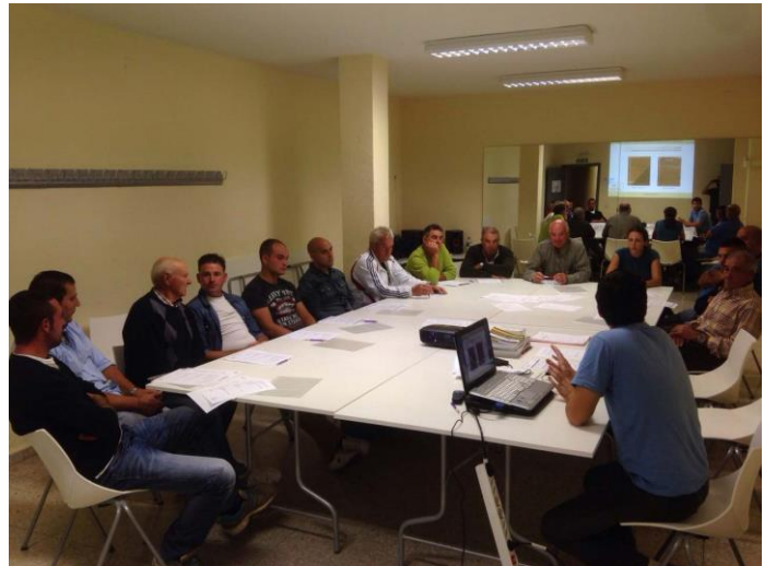
Figure 2. Working group held for the creation of the territorial and action plan with management guidelines to boost a quality agro-food system and a living landscape. A SWOT analysis was done to identify strength, weakness, opportunities, and threats with the participation of public administration technicians, policymakers and representatives from the agricultural sector.