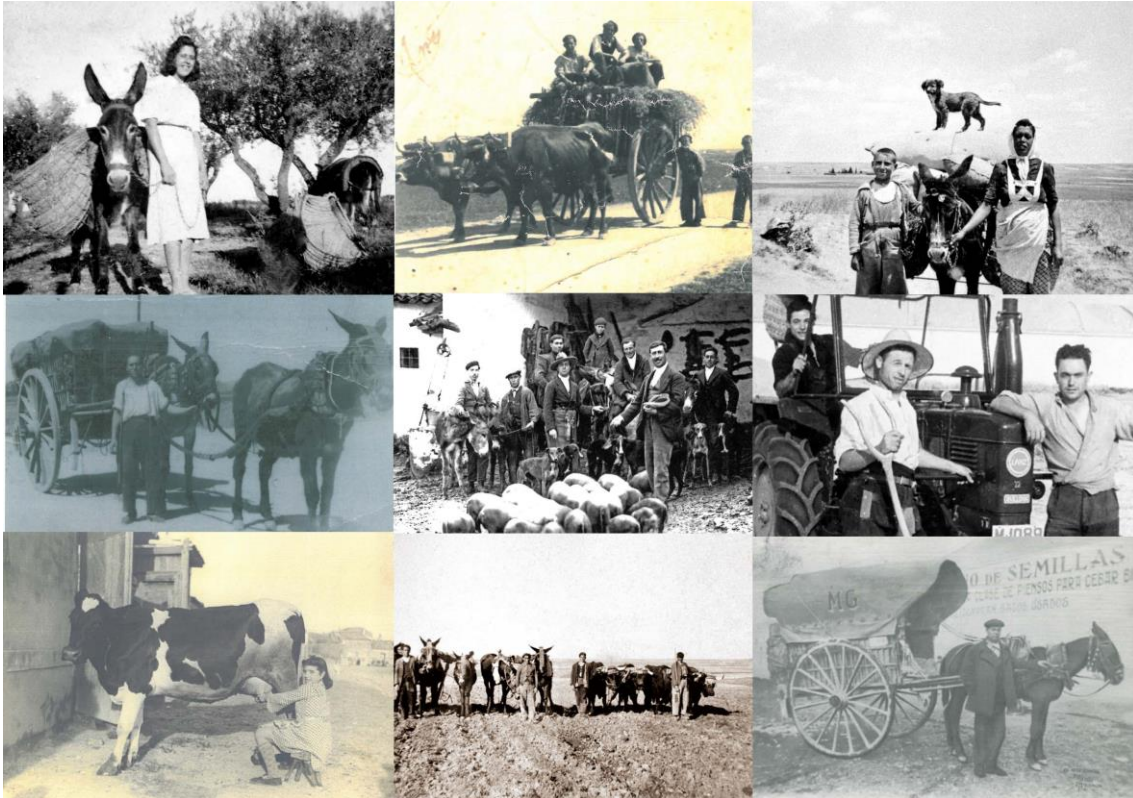
Figure 4: Travelling photographic exhibition on Fuenlabrada with photographs provided by residents, farmers and funds from the municipal archive.

The third phase of the process of heritage creation regarding the Huerta of Fuenlabrada aimed to describe the recent transformation dynamics, and define the landscape character based on shared heritage values related to agriculture. This process started with field work conducted together with the farmers, which focused on visually identifying and characterising the main landscape features and values: i) the layout and tangible components of the landscape (agroclimatic, geomorphological, hydrological and soil conditions and land use, including the crop mosaic), ii) the structure of properties and farms (Figure 5), iii) the dynamics and pressures of the territorial context, and finally, iv) the identification of the key elements of the landscape for later expert study and valorization.