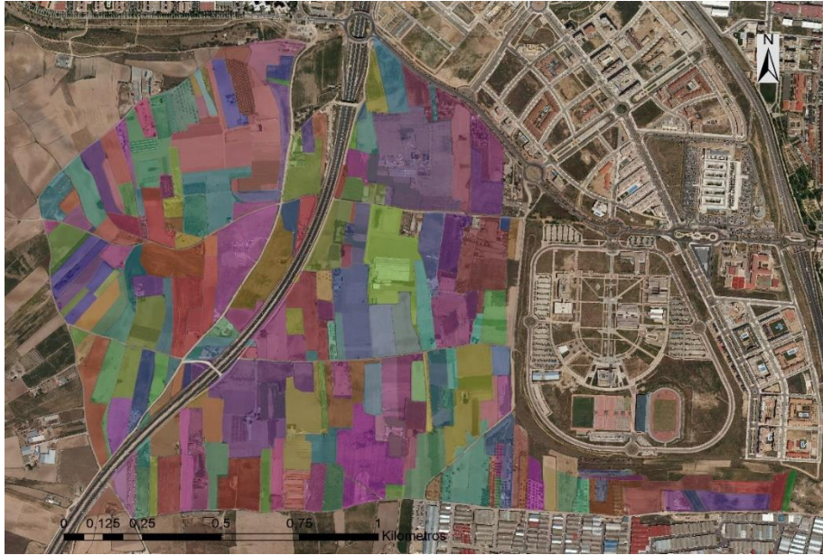
Figure 5: Historical plots in the Fuenlabrada Agrarian Park. Each color represents the property of a different landowner. Source: Yacamán Ochoa, C and Mata Olmo, R. (2017).

Interviews were later carried out with urban residents in Fuenlabrada who are not involved in agriculture to discover their perception of the current landscape. Moreover, we conducted a workshop using participative techniques based on collective creation processes to map the relevant socio-cultural information regarding the agrarian space that remains in the memory of the agrarian community and the local residents (Figure 6 and 7). During the workshop, people marked sites on the maps that were valuable in the past as they represent history, cultural identity and places with values related to traditions. The aim was the identification of observation points and itineraries, making the most of the network of rural paths and livestock routes and the inventory of the cultural and natural elements of major heritage interest (hydraulic infrastructure, plots, rural path network, other elements of ethnologic interest, etc.) This information is useful for the valorization of the agrarian landscape to enable public use and enjoyment.