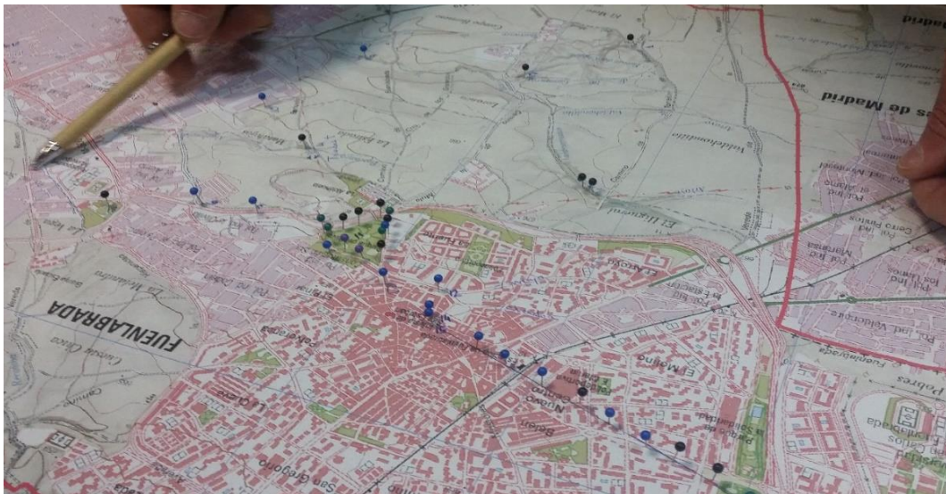
Figure 6 and 7: Workshop for the mapping of identity-forming elements related with cultural values of agriculture. The points marked features related to water, grazing, common pastures, public laundry areas, shrines, spiritual locations and hills.