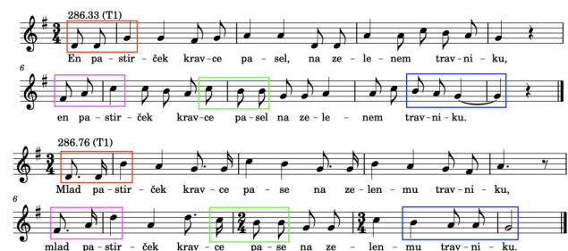
Figure 2. Two variants (out of 34) of the subtype 286.T1 with similar melodies with short melodic patterns in coloured squares.

We assume that the contrasting beginnings and endings of each verse offer pitch orientation for the singers, given the repetitive structure of narrative songs. The contour relationship between the first, middle, and last phrases supports the notion that “what goes up is likely to come down,” as proposed by Huron [13].