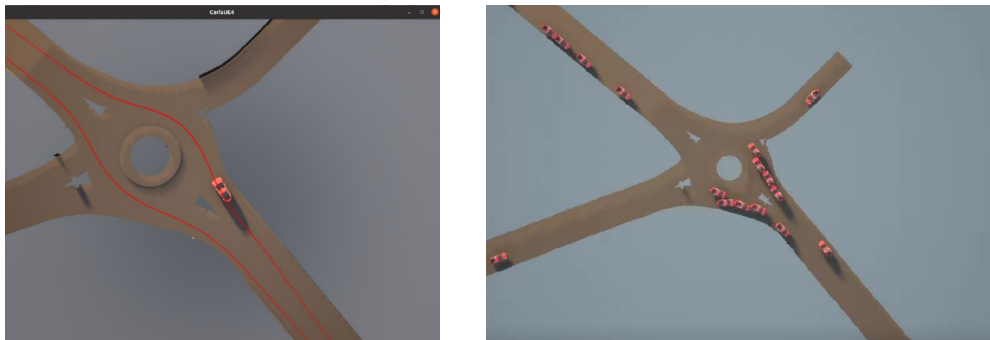
(a) Origin and destination points in RoundD (b) RoundD inbound roads for the O/D matrix

The two described strategies have been evaluated, which generated a CARLA roundabout scenario containing 259 vehicles, reproducing the traffic density and average speed of RoundD. Figure 4a depicts the integration in CARLA of one RoundD trajectory. Challenges when applying the direct trajectory approach with respect to matching car size to RoundD can be seen on Fig. 4b. If the OD and the waypoints correspond to RoundD, cars overlap at the interactions of the flows in the roundabout, where the inter-distance between vehicles is the smallest. The provided RoundD dataset does not provide sufficient details to extrapolate the right vehicle size and blueprint and as such, selected assumptions need to be taken on unavailable data.