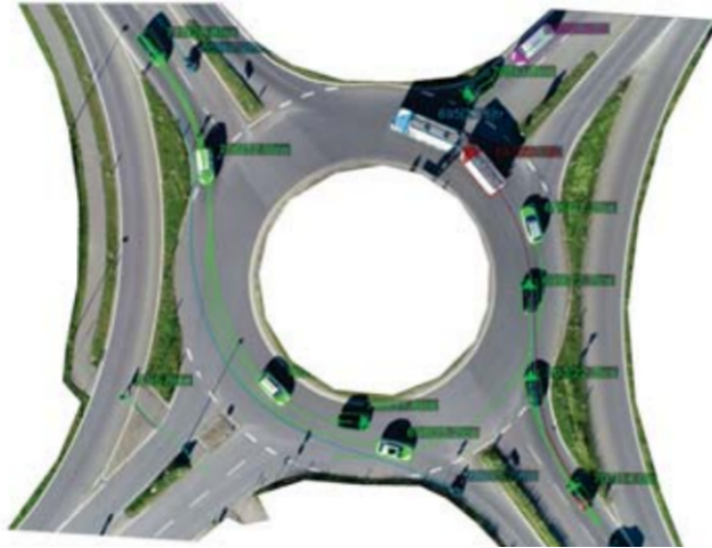
Figure 1: The RoundD Dataset

The RoundD (Roundabout Drone) dataset 5 (Krajewski et al., 2020) provides naturalistic trajectories of vehicles and vulnerable road users of selected German roundabouts. Each trajectory is recorded by drones with a error less than 10cm and includes vehicles (car, bus, trucks) as well as vulnerable road users (pedestrians, bicycles). The RoundD dataset, as well as its related datasets (HighD,