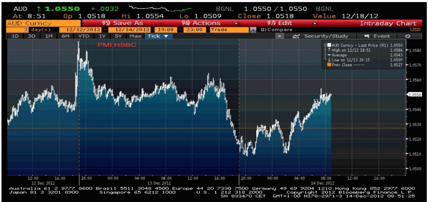
Figure (f): AUD/USD around HSBC PMI announcement - 2012/12/12 - 06:00