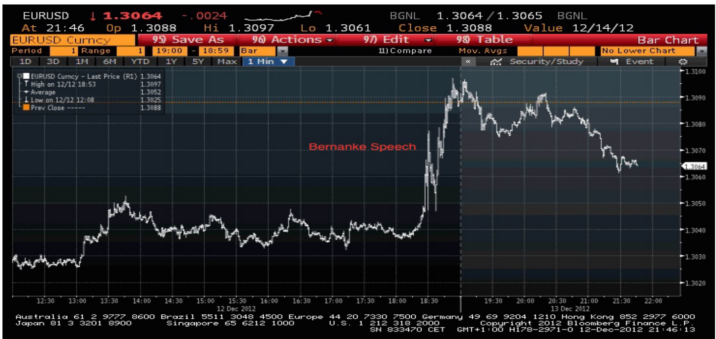
Figure (b): EUR/USD around federal target rate announcement - 2012/12/12 - 18:30