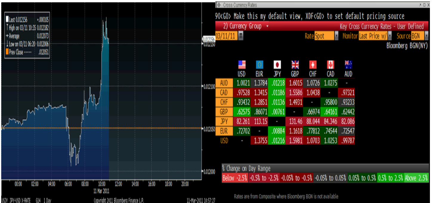
Figure (b): The effect of the Japanese earthquake: the JPY/USD (left panel) and the forex market (right panel)