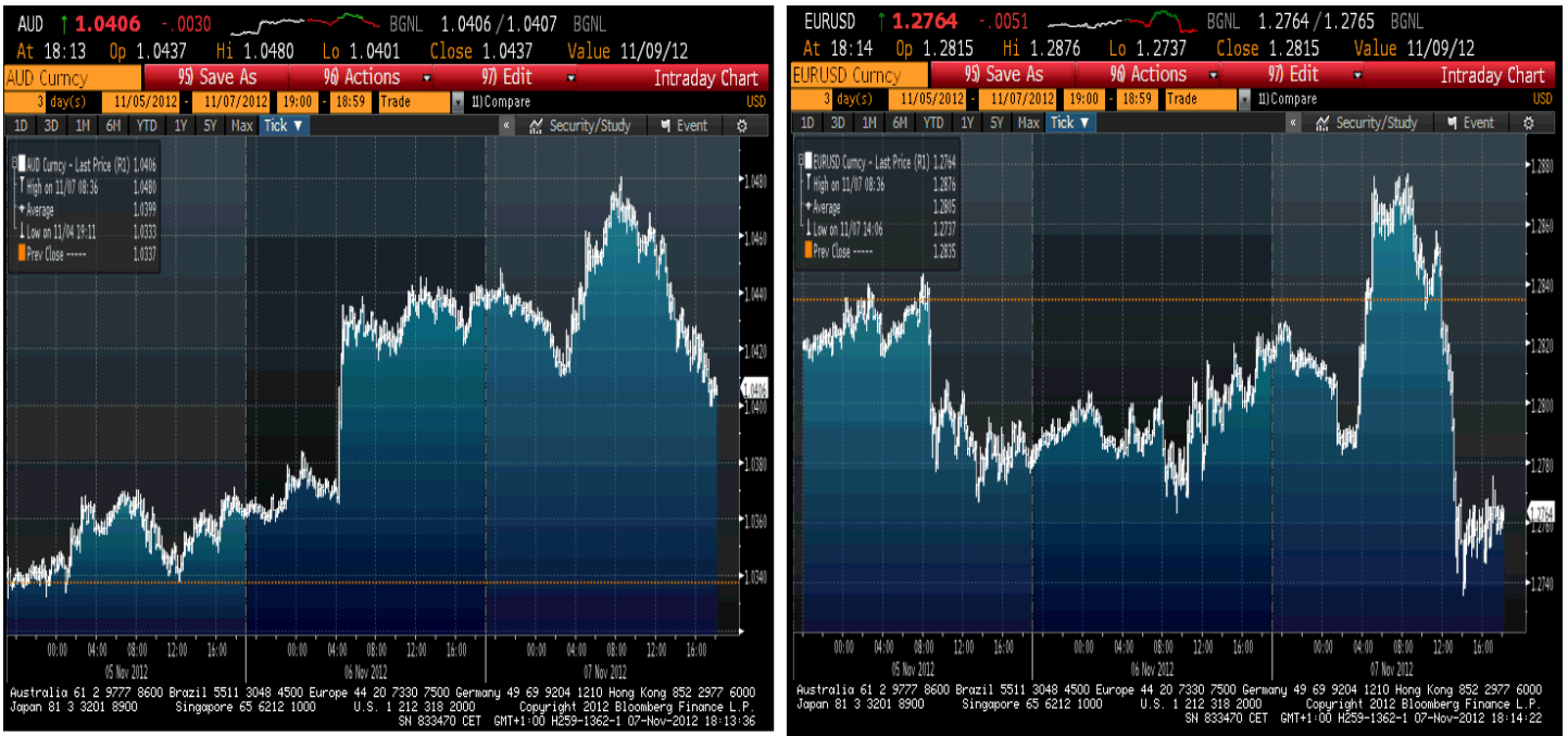
Figure (a): Jumps around U.S. elections: AUD/USD (left panel) and EUR/USD (right panel)