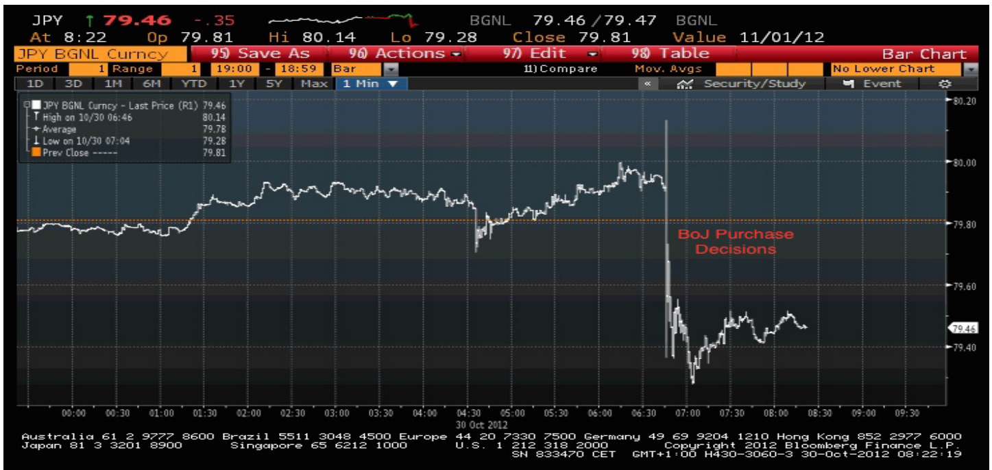
Figure (d): JPY/USD around Bank of Japan assets purchase decision announcement - 2012/10/30 - 06:45