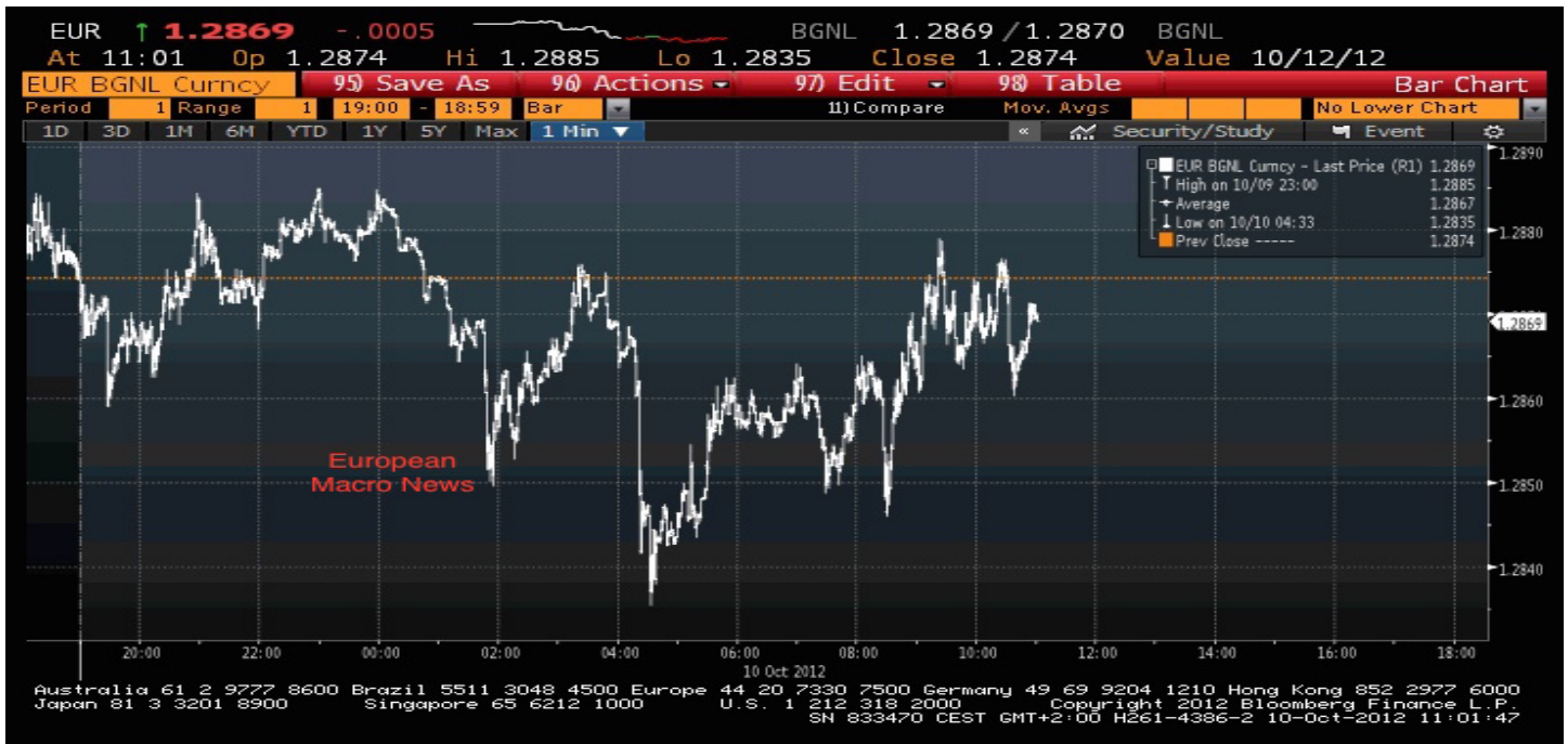
Figure (c): EUR/USD around aggregate european macro announcement - 2012/10/10 - 01:45