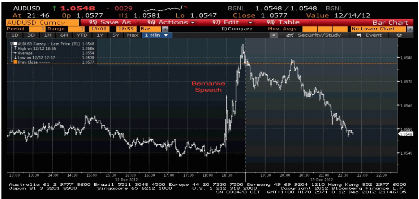
Figure (e): AUD/USD around federal target rate announcement - 2012/12/12 - 18:30