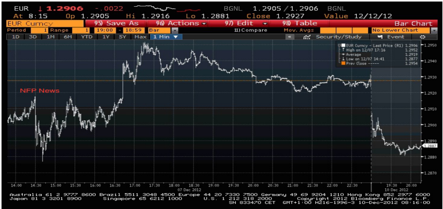
Figure (a): EUR/USD around NFP announcement - 2012/12/07 - 13:30