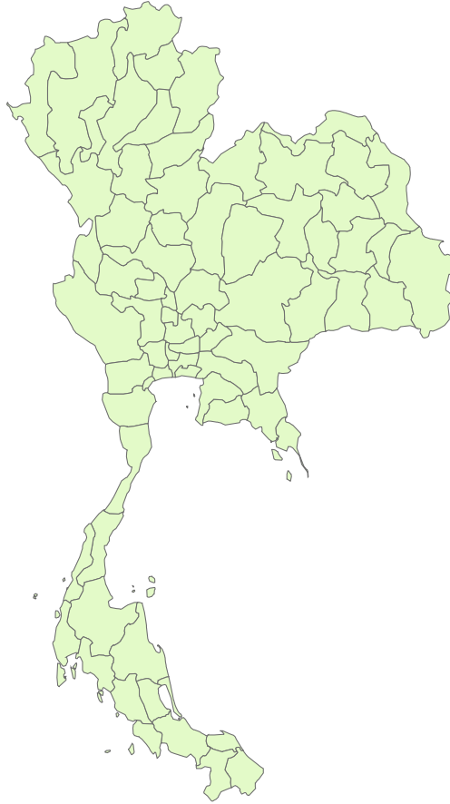
Figure 1: Thai Provinces