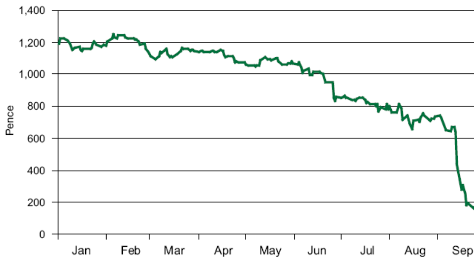
Chart 3: Northern Rock closing share price, January 1997 to September 2007

Source: Treasury Committee Report « Run on the Rock », January 2008