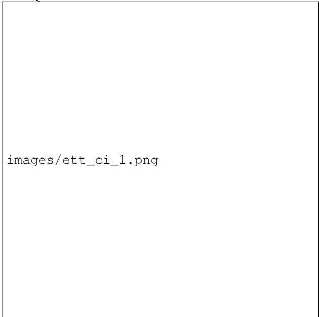
Fig. 1. We sample N = 100 trajectories under the GRU prior, conditioned on a set of commands from the validation split of the ETT dataset, and plot the associated 95% confidence intervals. As a baseline, we added samples from a VQ-VAE model.