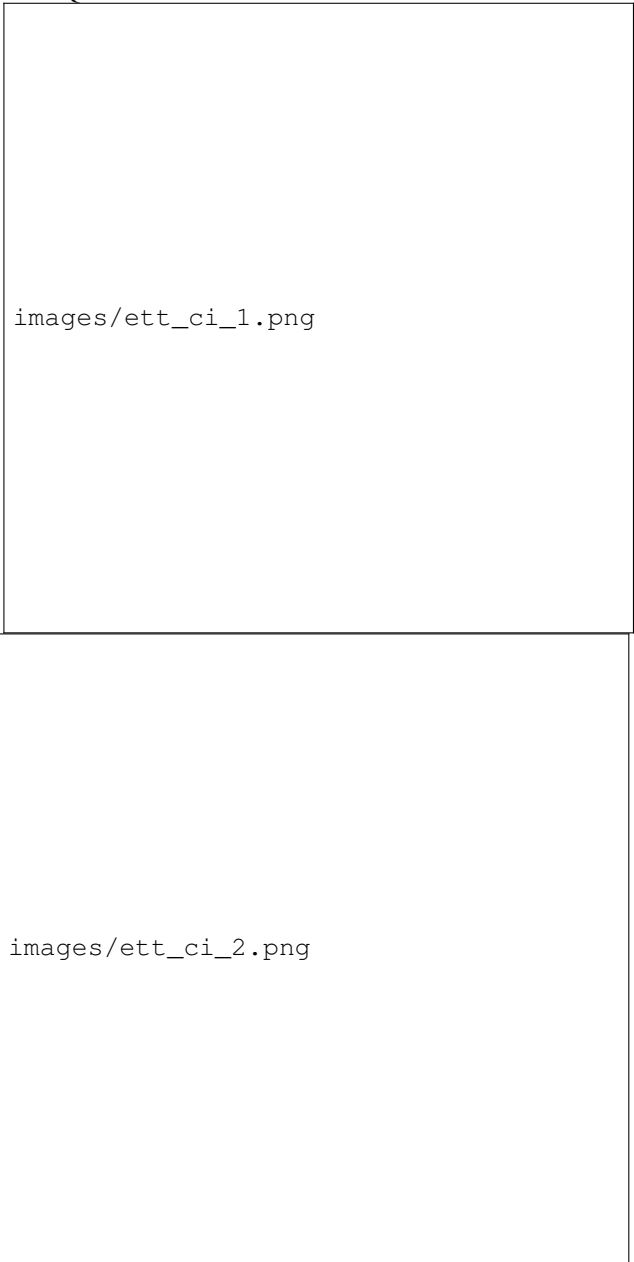
Fig. 1. We sample N = 100 trajectories under the GRU prior, conditioned on a set of commands from the validation split of the ETT dataset, and plot the associated 95% confidence intervals. As a baseline, we added samples from a VQ-VAE model.