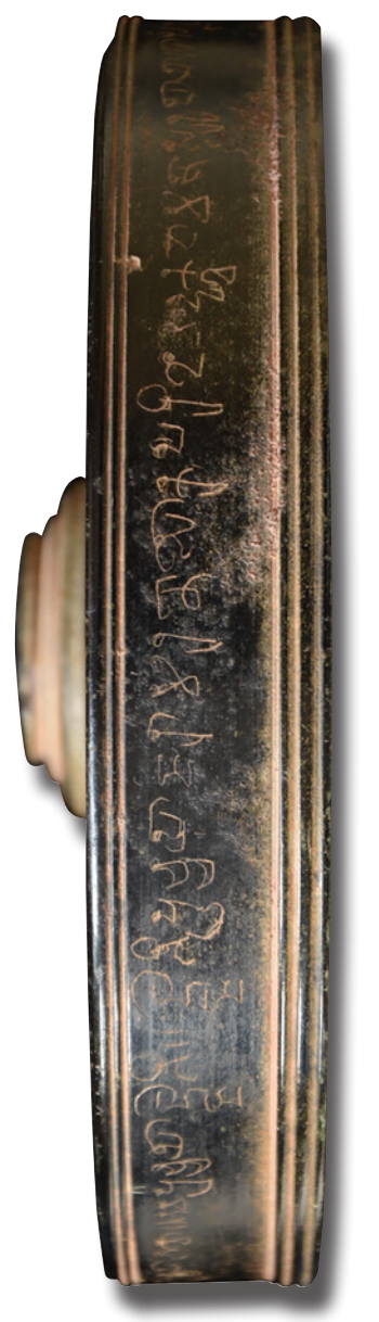
Fig. 8 — Details of the rim of the Devnimori reliquary's lid.