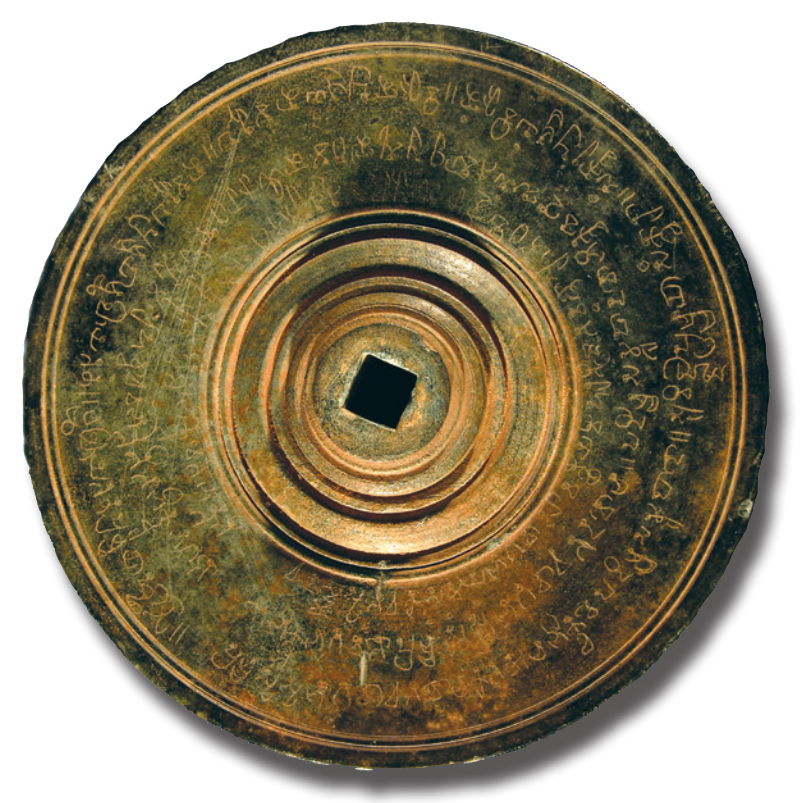
Fig. 3 — Top of the lid of the Devnimori casket.