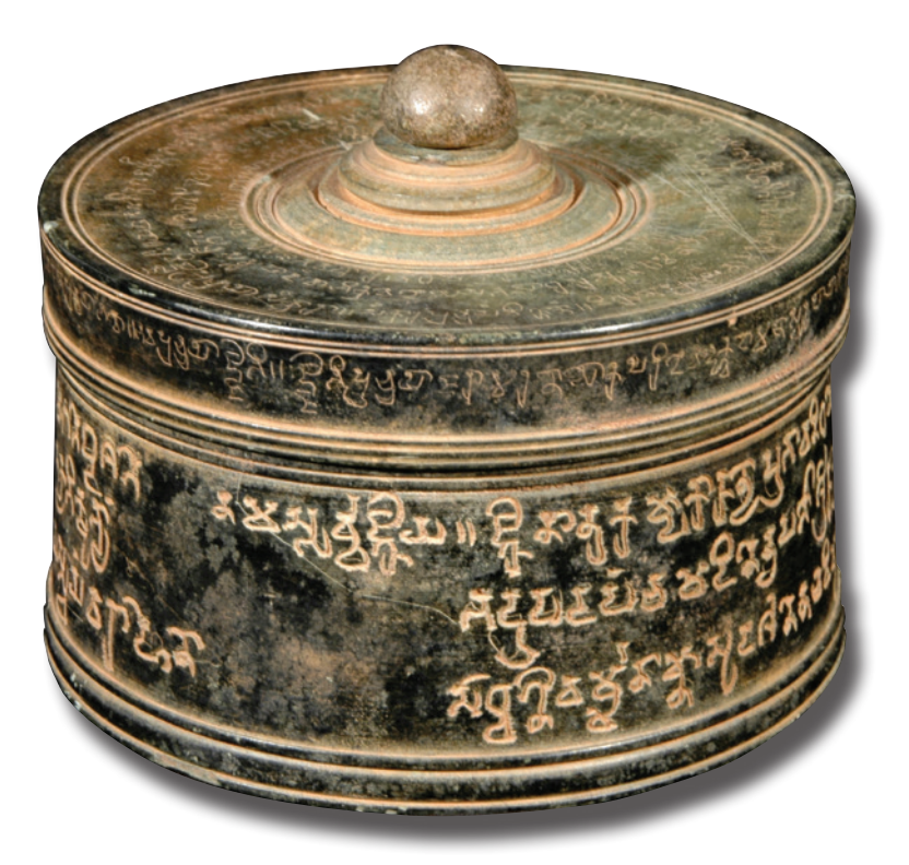
Fig. 1 — General view of the Devnimori casket.