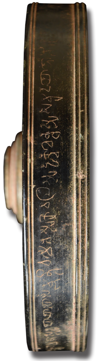
Fig. 10 — Details of the rim of the Devnimori reliquary's lid.