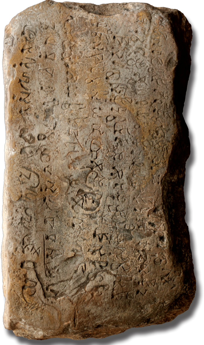
Fig. 13 — Inscribes slab found above Bagh's cave II (photo Peter Skilling; courtesy of the Archaeological Survey of India).