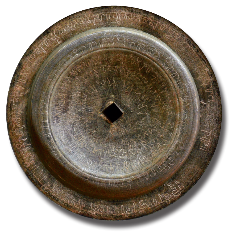
Fig. 12 — Back of the lid of the Devnimori casket.