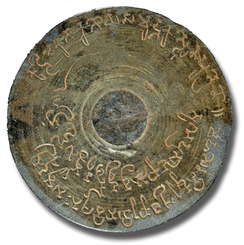
Fig. 2 — Bottom of the cylindrical box, Devnimori casket.