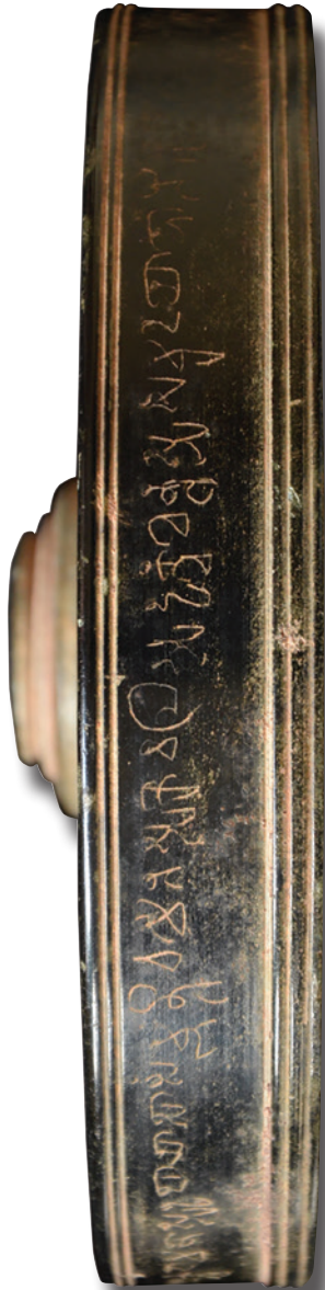
Fig. 10 — Details of the rim of the Devnimori reliquary's lid.