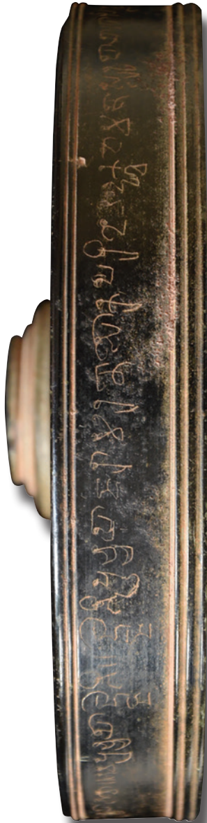
Fig. 8 — Details of the rim of the Devnimori reliquary's lid.