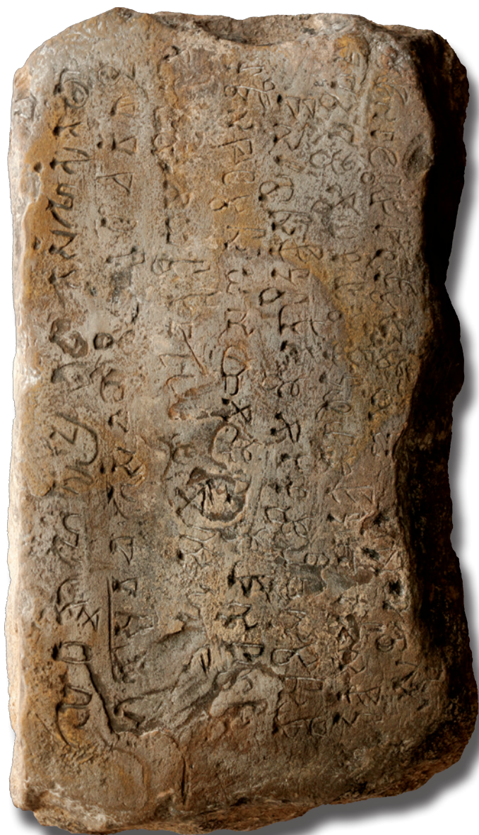
Fig. 13 — Inscriptes slab found above Bagh's cave II.