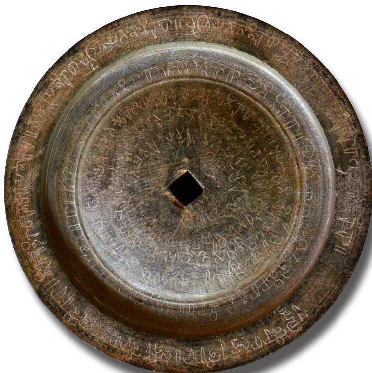
Fig. 12 — Back of the lid of the Devnimori casket.