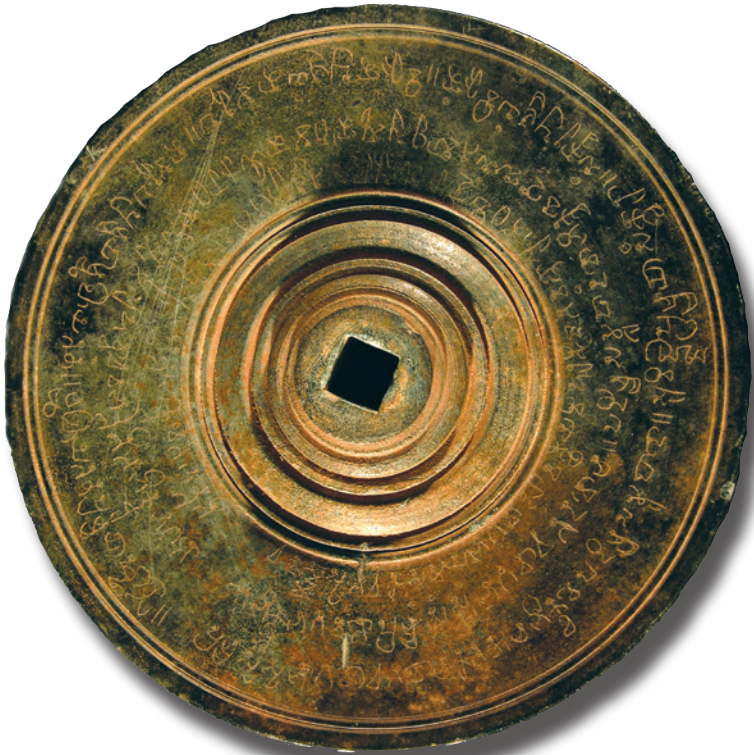
Fig. 3 — Top of the lid of the Devnimori casket.