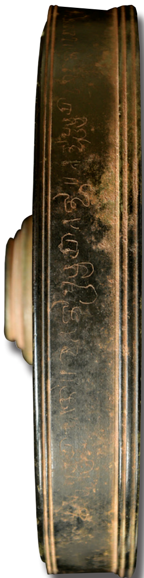
Fig. 5 — Details of the rim of the Devnimori reliquary's lid.