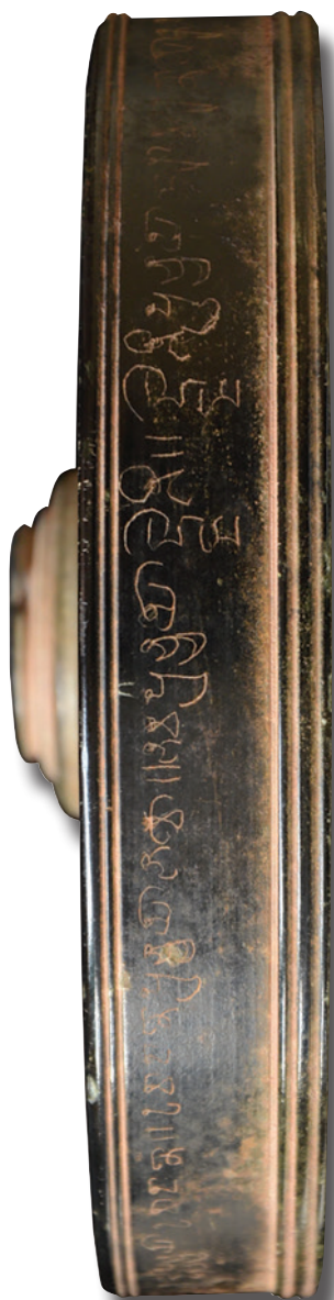
Fig. 7 — Details of the rim of the Devnimori reliquary's lid.