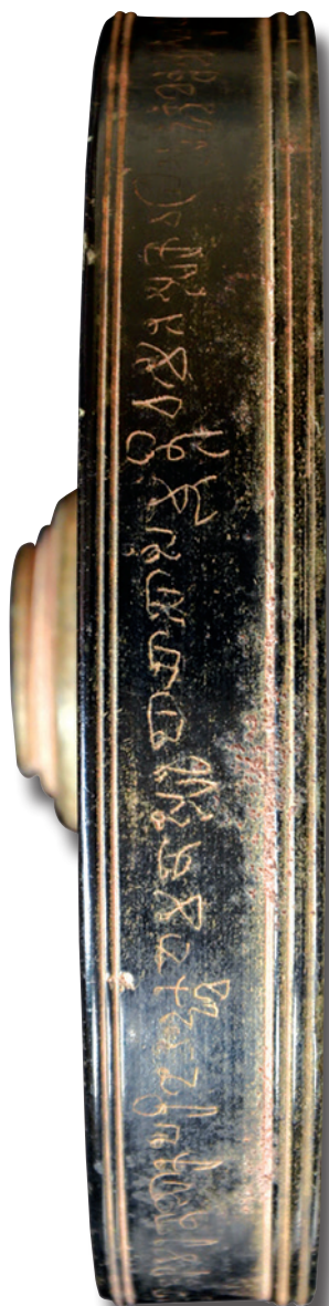
Fig. 9 — Details of the rim of the Devnimori reliquary's lid.