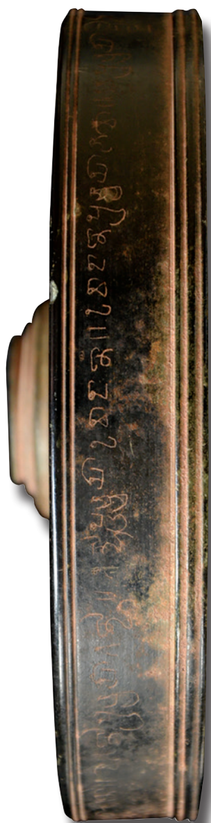
Fig. 6 — Details of the rim of the Devnimori reliquary's lid.