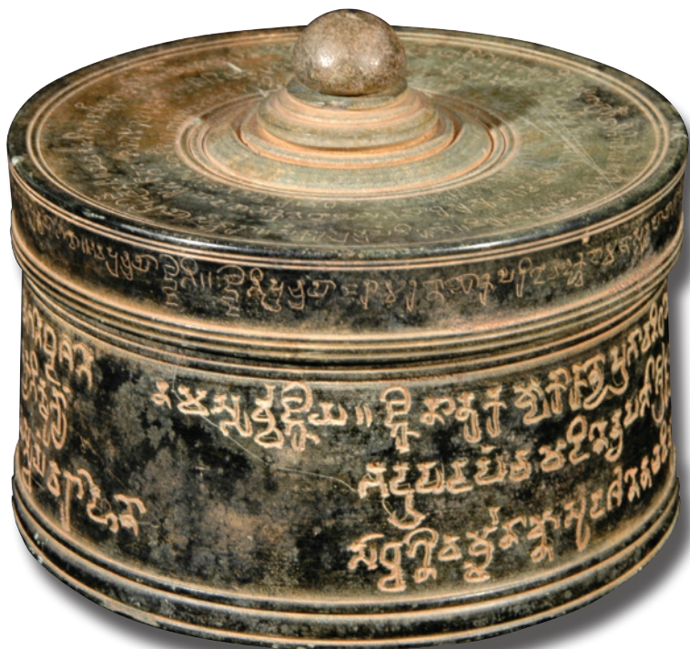
Fig. 1 — General view of the Devnimori casket.