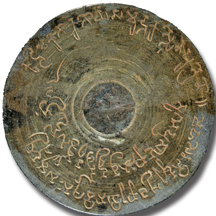
Fig. 2 — Bottom of the cylindrical box, Devnimori casket.