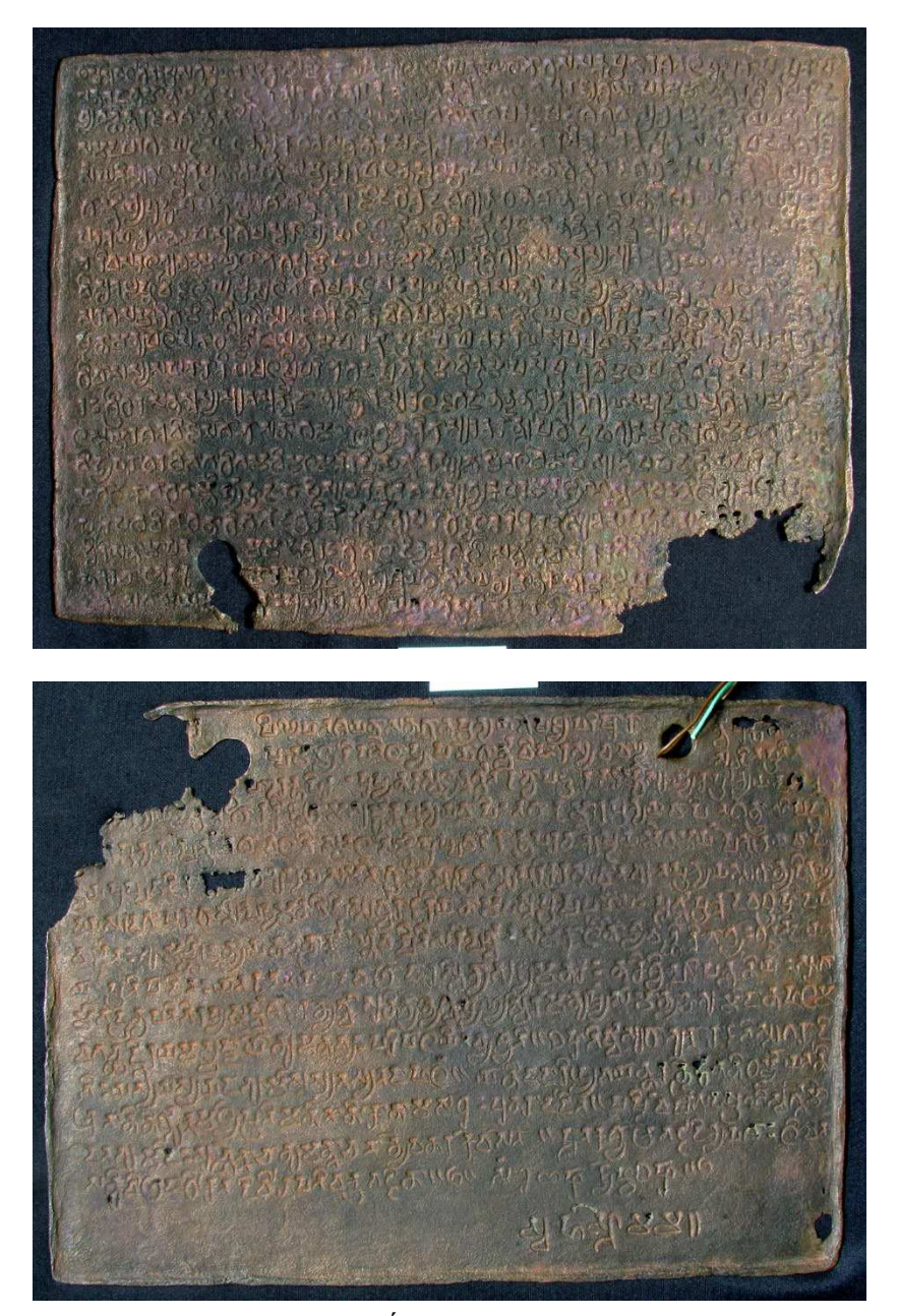
Fig. 1: Valabhipur plates of Śīlāditya I, [Valabhī] year 286, day 6 of the dark half of month Jyeṣṭha (no. 12, table p. 66). Courtesy Chhatrapati Shivaji Maharaj Vastu Sangrahalaya, Mumbai, museum accession no. 9.