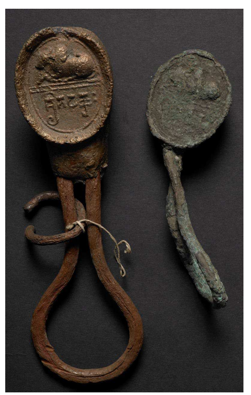
Fig. 2: Two Maitraka seals. Courtesy British Library, Ind. Ch. 66.