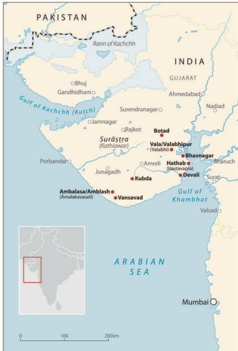
Map of the find-spots of the Buddhist copper-plate charters issued by the kings of the Maitraka dynasty.