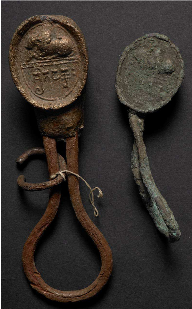
Fig. 2: Two Maitraka seals. Courtesy British Library, Ind. Ch. 66.