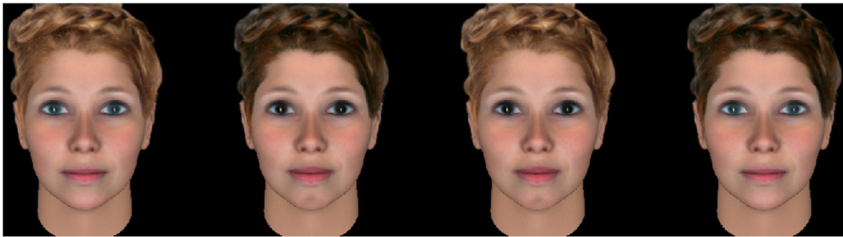
Figure 2. An example of a quartet used in Study 2. A Delphi-based computer program was used to present the virtual women's faces. For a given rater, four faces of the same virtual woman were selected, depending on the rater's own traits (initially recorded in the computer program by the observer; see table 1). These four faces corresponded to the four cases of preferences: homogamy (the face displayed similar character states as the rater), heterogamy (the face displayed opposite character states), recessivity (the face displayed recessive character states) and dominant (the face displayed dominant character states). The rater was instructed to click on the woman that he would prefer to build a family with. Images are from virtual subjects. doi:10.1371/journal.pone.0049791.g002

tion”, “house ownership”, “taxability” and “education level”), as well as variables affecting women's attractiveness, such as fluctuating asymmetry, degree of femininity, lip contrast and age. For asymmetry and femininity, non-linear adjustments were explored. Because in some photographs the women subjects displayed a perceptible smile, a qualitative variable describing this aspect (absent, slightly perceptible, perceptible) was also introduced as a potential confounding effect on attractiveness. Indices of homogamy and recessivity were also calculated for each trait independently. These 7 binary variables were used in a model where only significant confounding variables of the previous model were added (the age of the raters and of the women subjects, smile, asymmetry and femininity). The data were analyzed by multi-model inference [37,38]. The fits of all possible models were compared using AIC, allowing their Akaike weights to be calculated (R package MuMin). Model averaging was performed on all models, weighting the contribution of each model according to its Akaike weight [39]. The relative importance of each variable (the sum of the Akaike weights of the models in which the variable appears) and the averages of estimates (weighted by Akaike weights) were calculated. All statistical analyses were performed using R 2.14.0 software (R Core Development Team, 2005).