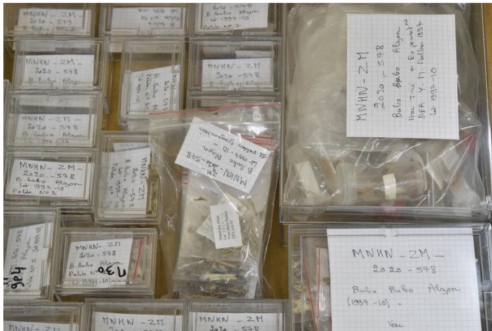
Figure 3. Example of Bubo bubo assemblage from Alzon with LAB boxes harbouring two labels: official catalogue registration number of the Zoology Mammals collection: MNHN-ZM-2020-578, and the initial study number: 1997–10.