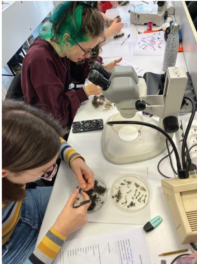
Figure 1. Msc students training with owl pellets in MNHN Paris (@Sandrine Grouard courtesy).