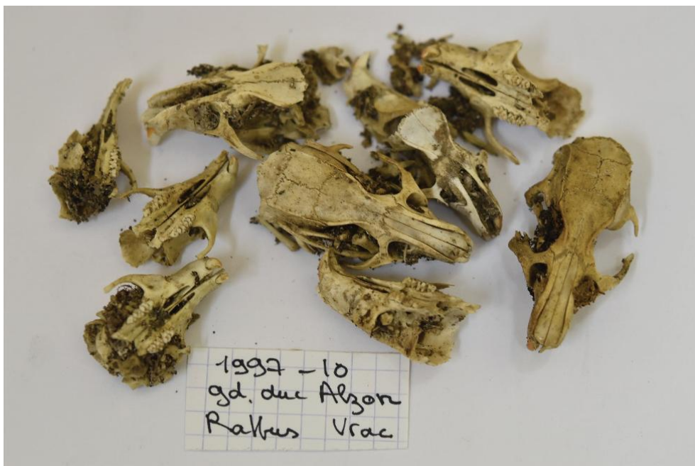
Figure 2. Rodent skulls extracted from Bubo bubo pellets from Alzon (France) roosting area before entrance into the MNHN collection. The number 1997–10 corresponds to a provisional number attributed before catalogue number for storage before taphonomic study.