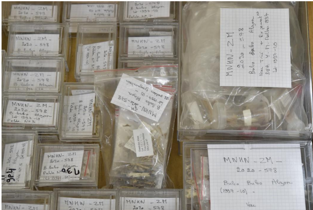
Figure 3. Example of Bubo bubo assemblage from Alzon with LAB boxes harbouring two labels: official catalogue registration number of the Zoology Mammals collection: MNHN-ZM-2020-578, and the initial study number: 1997–10.