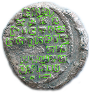
Figure 2: Annotated contours of characters and abbreviation marks.