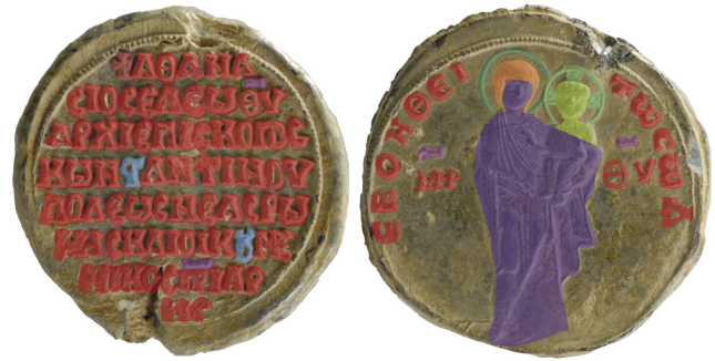
Figure 3: Annotated seal at pixel level (red=character, blue=ligature, lilac=abbreviation mark, purple=Virgin Mary, yellow=Christ Child, green=nimbus, orange=veil)

annotated by manually setting points on their contours, the outside contour, and the inside one (see Figure 2). From these contour points, a pixel-level annotation could be derived, as well as the bounding box of each character (see Figure 3).