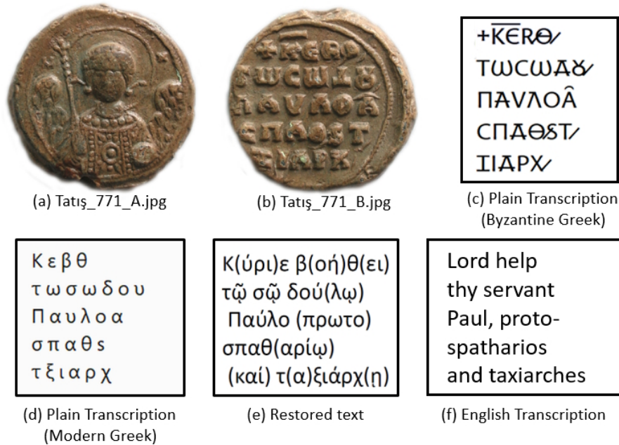
Figure 1: Sample seal images. In this case, the obverse side (a) includes iconography, while the reverse side (b) includes an abbreviated text in Greek. We show plain transcriptions (c) and (d), the text to recover (e), and the English transcription (f).

or broken, making their inscriptions difficult or impossible to read. However, given their intrinsic properties, such as the consistency between an image and its associated text, as well as the similarities between different seals belonging to the same person, historians can make assumptions about the missing parts.