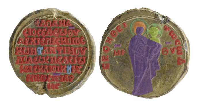
Figure 3: Annotated seal at pixel level (red=character, blue=ligature, lilac=abbreviation mark, purple=Virgin Mary, yellow=Christ Child, green=nimbus, orange=veil)

We started by using the Tatiş image collection [4]. Then, after having established the annotation protocol (labels, choice of software, characters, and objects to be annotated), the manual segmentation began with the participation of domain experts. They worked first on the transcription of texts at line level (but without providing line positions) and at character level (with character position) using the Supervisely <sup>3</sup> platform. Characters have been