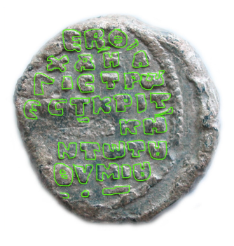
Figure 2: Annotated contours of characters and abbreviation marks.

HIP '23, August 25-26, 2023, San Jose, CA, USA