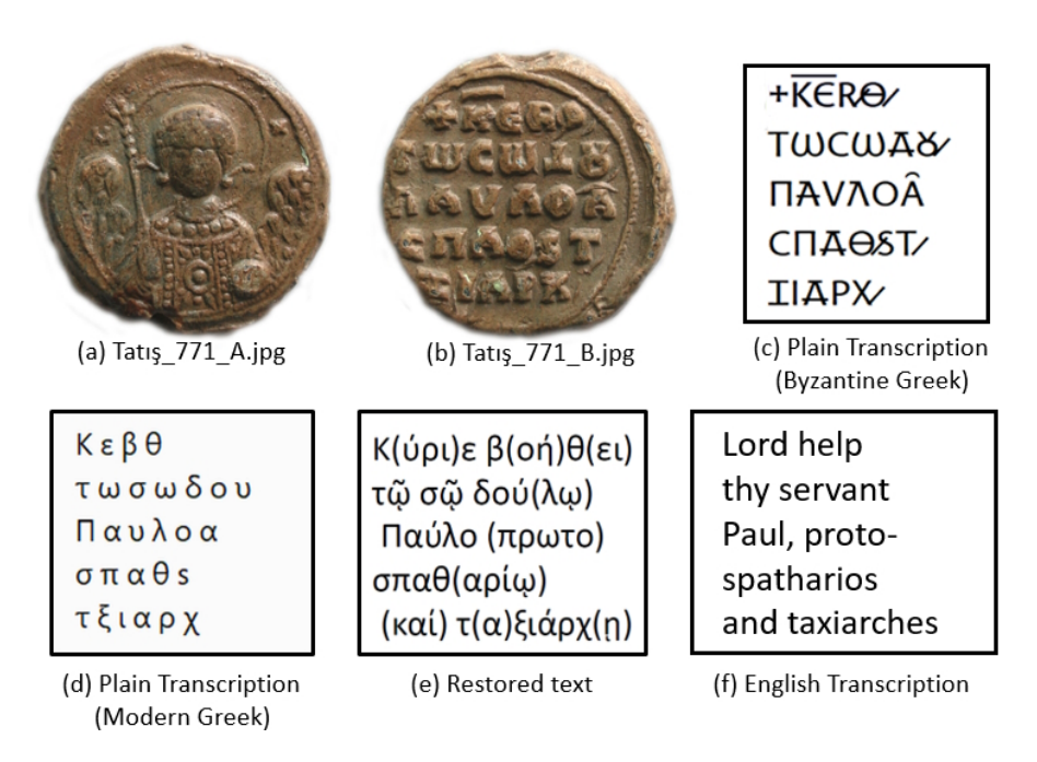
Figure 1: Sample seal images. In this case, the obverse side (a) includes iconography, while the reverse side (b) includes an abbreviated text in Greek. We show plain transcriptions (c) and (d), the text to recover (e), and the English transcription (f).

or broken, making their inscriptions difficult or impossible to read. However, given their intrinsic properties, such as the consistency between an image and its associated text, as well as the similarities between different seals belonging to the same person, historians can make assumptions about the missing parts.