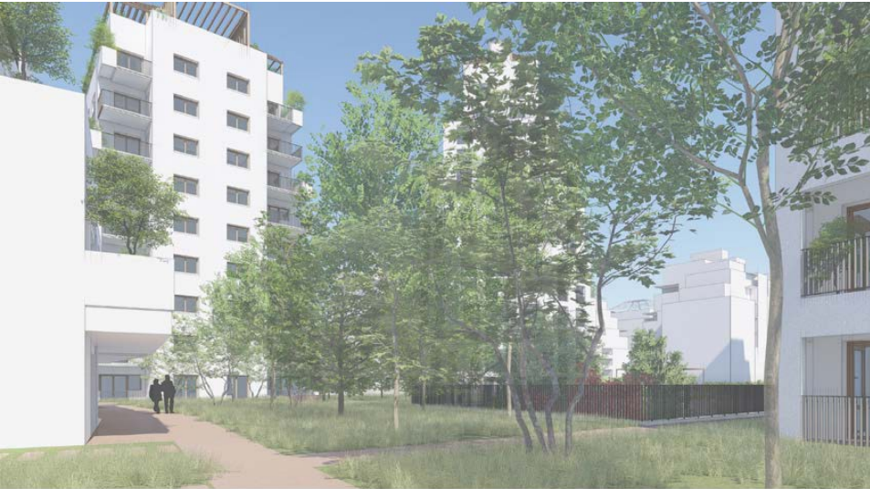
GRATTE-CIEL | MACRO-LOTS B | ATELIER 8 | 27/07/2020 31