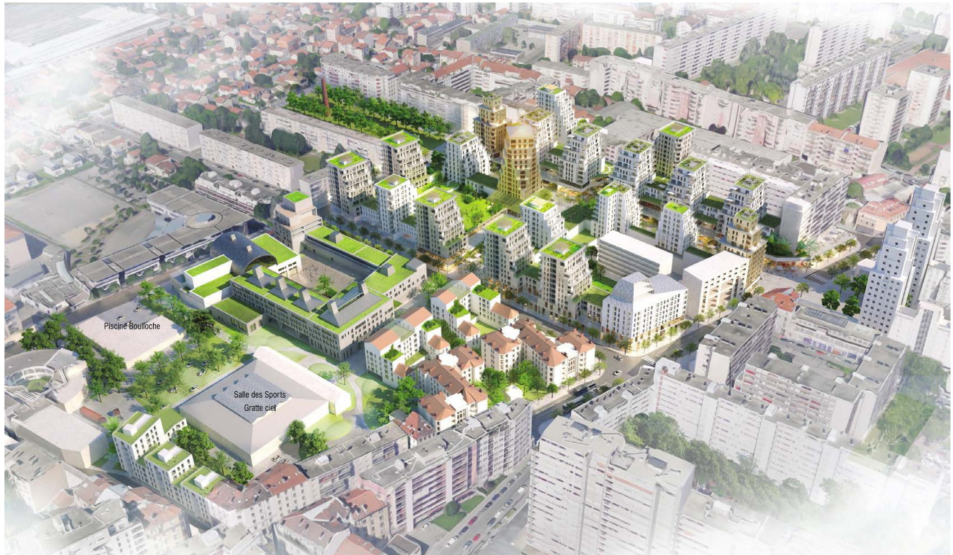
Vue aérienne du projet Gratte-ciel "Centre-ville"