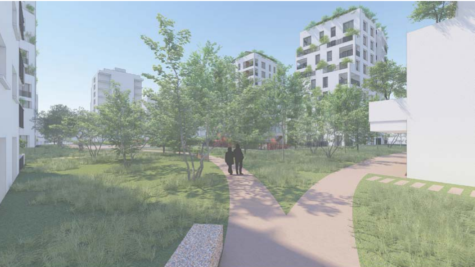
GRATTE-CIEL | MACRO-LOTS B | ATELIER 8 | 27/07/2020 30