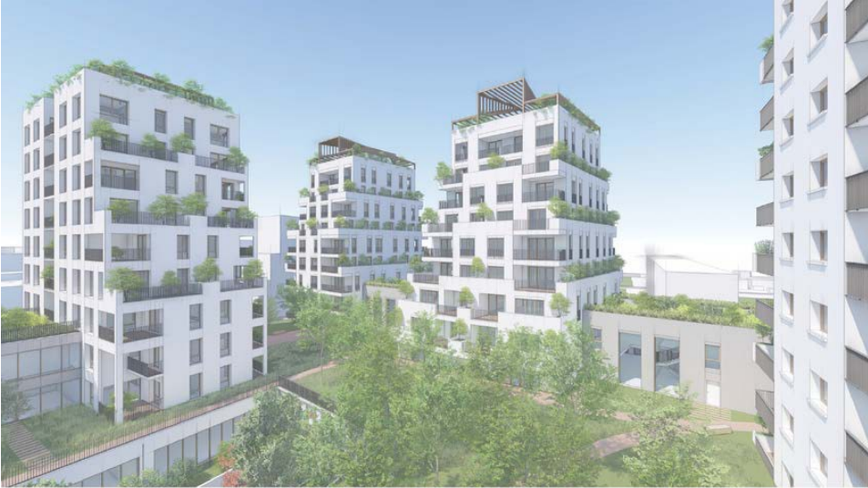
GRATTE-CIEL | MACRO-LOTS B | ATELIER 8 | 27/07/2020 28