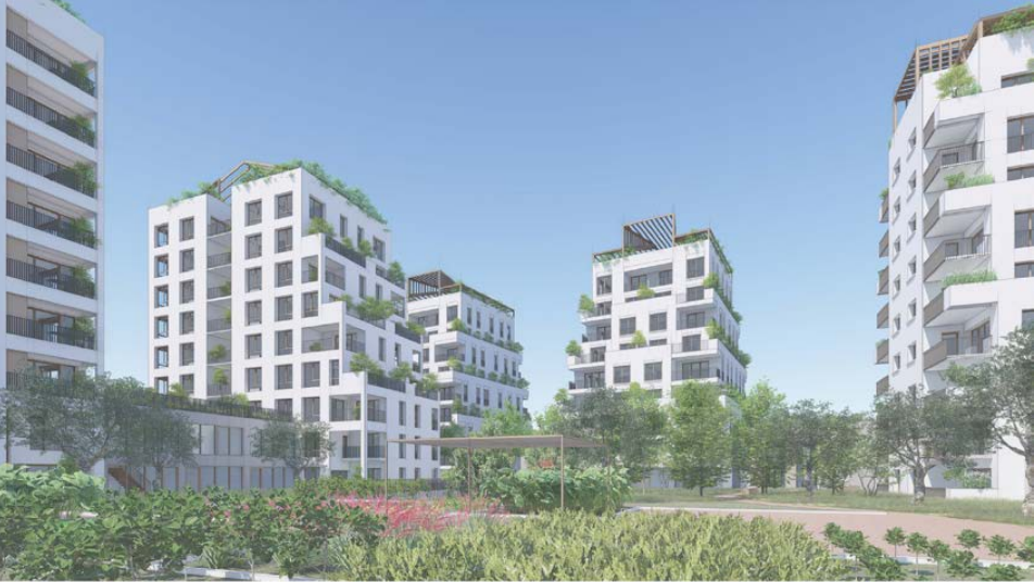
GRATTE-CIEL | MACRO-LOTS B | ATELIER 8 | 27/07/2020 29