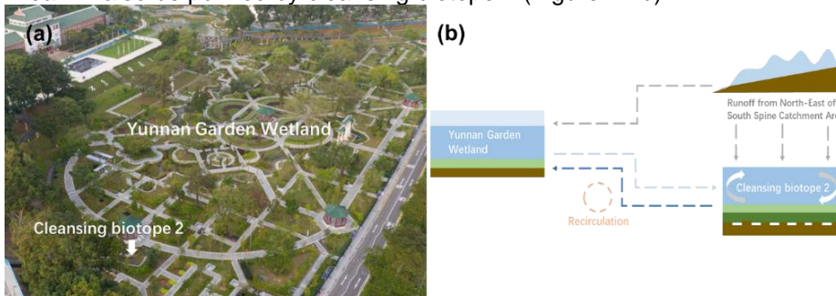
Figure 2.1 The location (a) and water circulation (b) of cleansing biotope 2 in Yunnan Garden

The first pilot site is the cleansing biotope 2 in Yunnan Garden of Nanyang Technological University, located in the southwest of Yunnan Garden (Figure 2.1). The cleansing biotope 2 has a typical design including plants, cleansing layer (filter media inside), transition layer (for preventing filtration media from entering the drainage layer), drainage layer (for assisting in the drainage of the effluent), and geotextile layer. Through water recirculation, the cleansing biotope purifies water pumped through pipes from Yunnan Garden Wetland, and discharges the treated water back to the wetland and then to the nearby canal along the Expressway. In addition, part of the runoff from North-East of South Spine Catchment Area will also be purified by cleansing biotope 2 (Figure 2.1b).