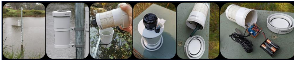
Figure 2. System installed on the field (on the left of the pole) and photos of the encapsulation system made for easy fixing and removal without changing the location of the sensor.

Field installation. The system is encapsulated in a 100 mm PVC pipe in order to provide a cheap waterproof case and make it less noticeable, with the aim of reducing the risk of vandalism. The enclosure also allows easy removal/replacement without changing its location. Figure 2 presents the system deployed on site. The system runs on three AA rechargeable batteries and a 0.5 W solar panel.