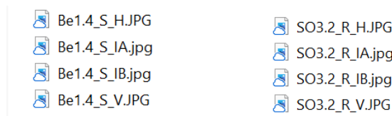
Figure 2: On the left, the four images in the sub-folder (Be1.4_S) for the beam. On the right, the four images in the sub-folder (SO3.2_R) for the bridge.

Each sub-folder comprises four “jpeg” files: the two visible images and the two GPR images. The first part (up to the second underscore) of the name of each file matches exactly the name of the parent folder. The suffixes IA and IB correspond to frontal and oblique images respectively. The GPR files have either the suffix H (Horizontal acquisition) or V (vertical acquisition). two example of a sub-folder containing the 4 files, are shown in Figure 2-left for the beam, and Figure 2-right for the bridge.