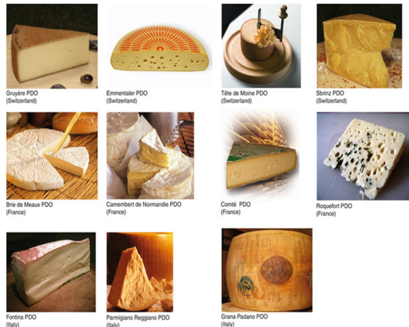
Figure 2. Examples of European cheese varieties made exclusively from raw milk.

Normandie and Brie de Meaux, or Parmigiano Reggiano in Italy, as well as Swiss cheese varieties such as Emmentaler and Gruyère, and various alpine cheeses (e.g., L'Etivaz and Berner Hobelkäse) are still made fully from raw milk. Statistics of the year 2018 show that around 30% of Swiss as well as Italian cheeses and 11 % of French cheeses are produced from raw milk.