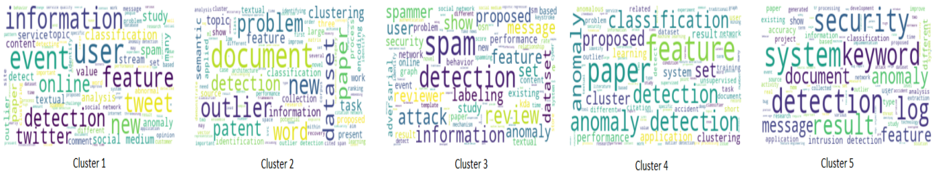
Fig. 2: Word cloud of the five obtained automatic clusters.