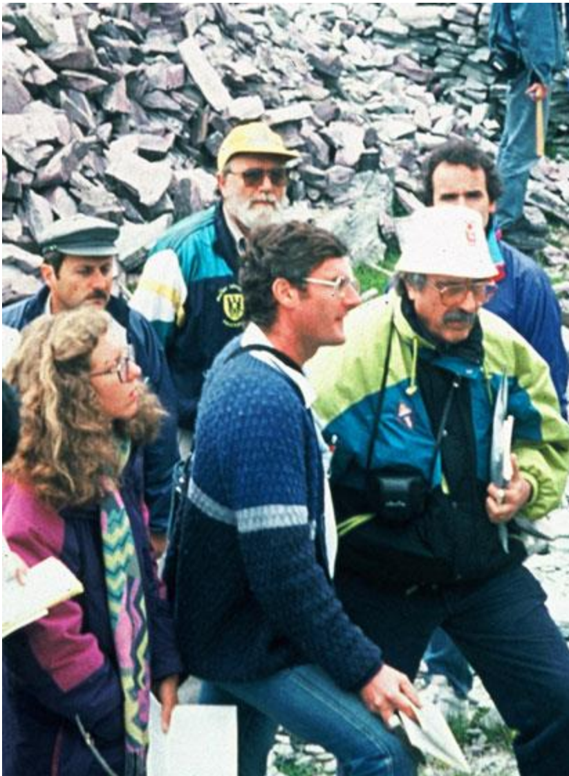
Fig. 1 Bernard Kübler in 1991 (with yellow cap) visiting a piemontite- schist quarry on the South Island of New Zealand during the IGCP project 294 excursion.

Comparing Bernard Kübler (Fig. 1) and Martin Frey (Fig. 2) is not possible. Both had a very different personality and research character. Even so, it is evident from their literature lists that they were very different. Bernard Kübler used to be innovative and curious to try new things (either applying KI and the smectite-illite reaction progress in different fields). Martin Frey was more systematic with a focus on orogenic belts and restricted areas and applying different methods. During excursions, Bernard tended to deep and long, stimulating discussions retarding the approach to the next outcrop; Martin was enthusiastic on facts and memorising incredible details and he was just on time at the next outcrop. Nevertheless, the collaboration of the Neuchâtel and Basel groups are the reason why Switzerland was a leading country in very low-grade studies during two decades.