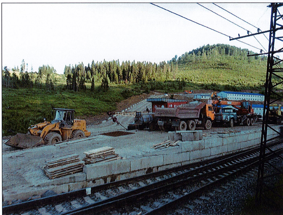
Photo 3. Construction of the new Beskydskyi tunnel

After 1991 the role of international railway communication via Transcarpathia has tremendously increased. This is mainly due to the fact that Ukraine carries out its exports to Hungary, Romania and Slovakia mainly by railways. According to our calculations, in 2011 the share of railway transport