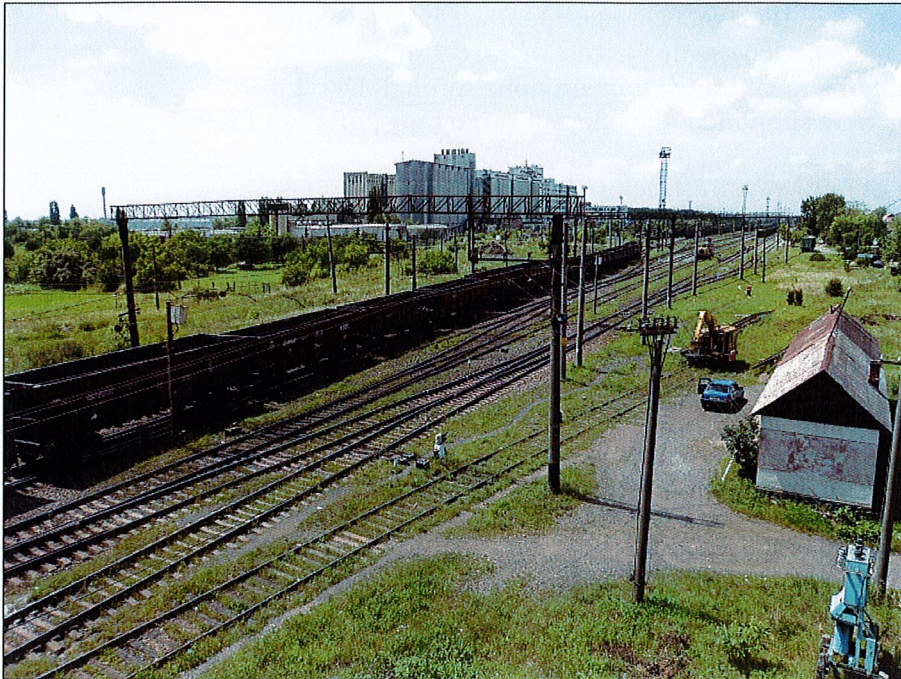
Photo 2. The modernised freight station of Uzhgorod II