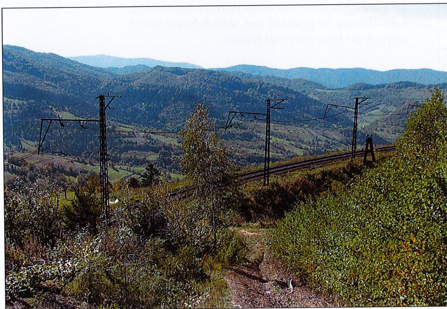
Photo 1. Railway line near Uzhok station (Velykobereznianskyi Raion)

The Beskydskyi Pass is the most intensively used pass today, through which the main Ukrainian binary electrified railway of international significance Moscow-Kyiv-Lviv-Uzhhorod/Chop passes. It is continued in the Hungarian and Slovak railway network. The high ranges of Carpathians make high speed communication impossible ( Photo 1 ).