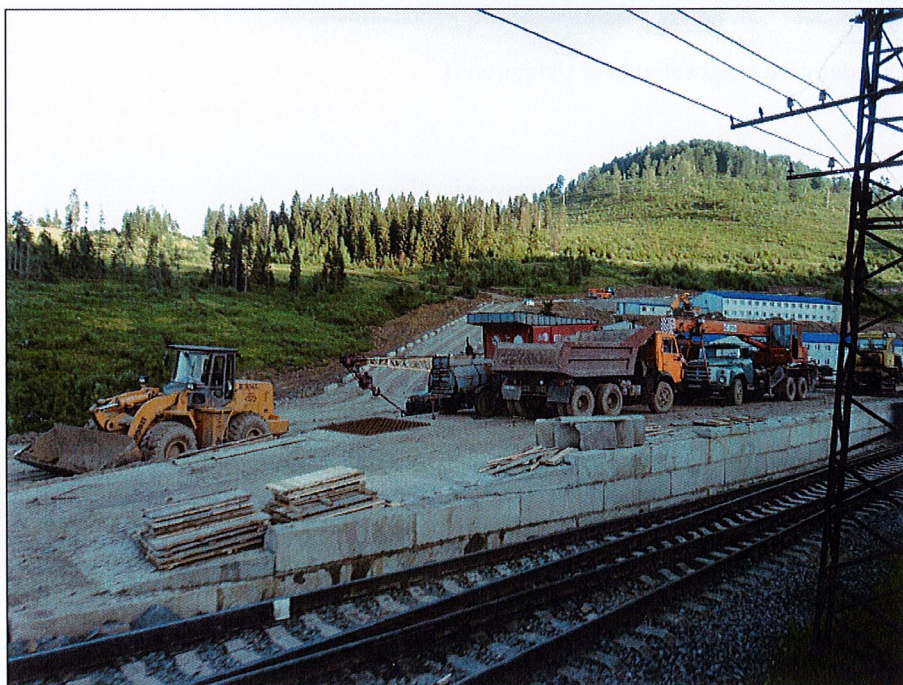
Photo 3. Construction of the new Beskydskyi tunnel

After 1991 the role of international railway communication via Transcarpathia has tremendously increased. This is mainly due to the fact that Ukraine carries out its exports to Hungary, Romania and Slovakia mainly by railways. According to our calculations, in 2011 the share of railway transport