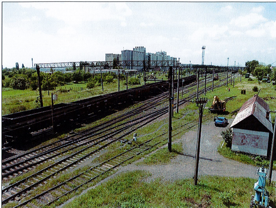
Photo 2. The modernised freight station of Uzhgorod II