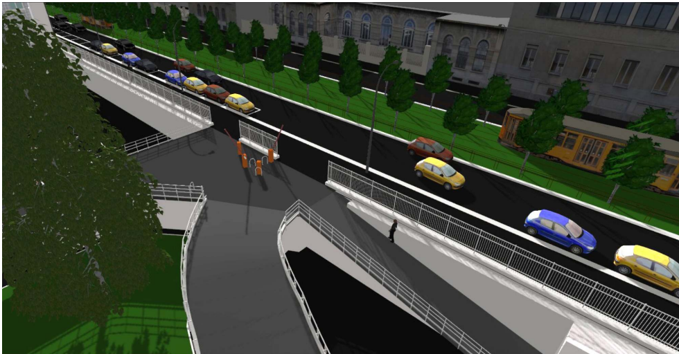
Illustration 3: The 3-D model of via Edoardo Bonardi and surroundings, imported into the game engine environment