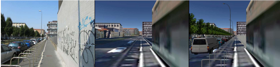
Illustration 2: From the left: the real environment compared with the low resolution 3-D model provided by Google Earth and the 3-D model enriched by the Author