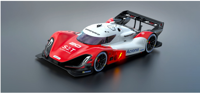
Figure 2 Devbot 2.0 – all-electric vehicle currently used in the Roborace competition

Roborace (Roborace 2022) is a global championship between autonomous cars. The hardware (the race cars) is the same for all participating teams; each gets access to an autonomous race car called Devbot 2.0, and develops software to drive it in races, in a completely autonomous way. Each season sees changes in the goals and rules, and the introduction of new conditions.