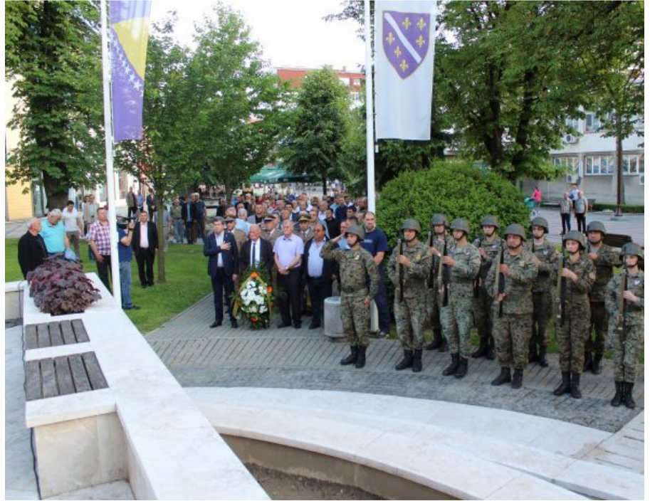
Figure 4: Commemoration at the Bosniak monument on Brigade Day.