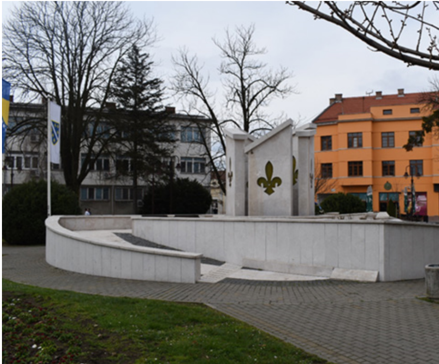
4 The Association of Families of Missing and Forcibly Abducted and Killed Bosniaks in the Brčko District