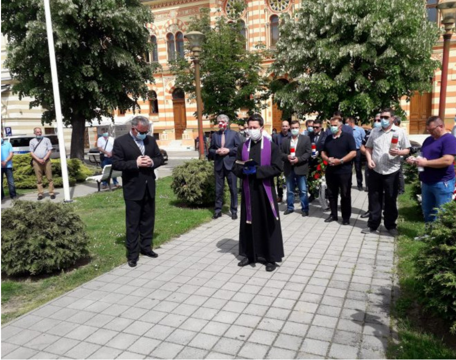
Figure 6: Commemoration at the Croat monuments at the occasion of the 28th anniversary of HVO.