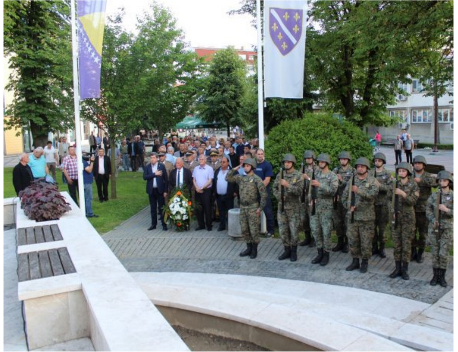
Figure 4: Commemoration at the Bosniak monument on Brigade Day.