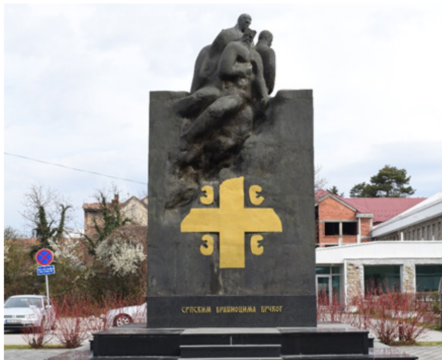
Figure 1: Monument “to the Serb Liberators/Defenders of Brčko”.