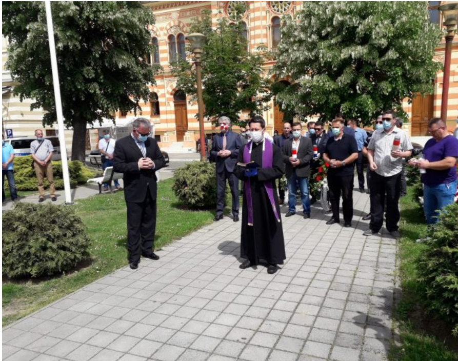
Figure 6: Commemoration at the Croat monuments at the occasion of the 28th anniversary of HVO.