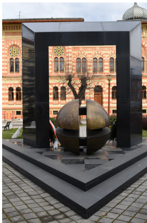
Figure 3: Monument to the "108th HVO Infantry Brigade"; erected in the city center.

5 HVO, paramilitary formation funded by Croatia