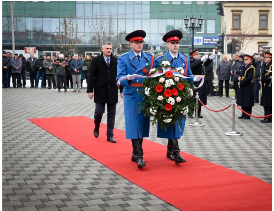
Figure 5: Commemoration at the Serb monument on the Day of the Republic.