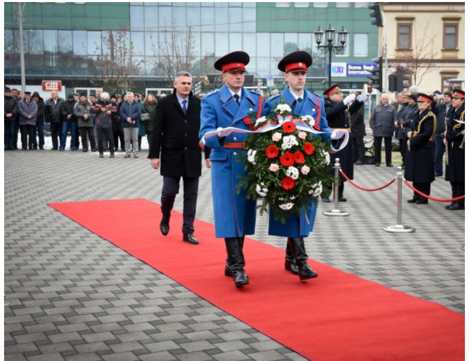
Figure 5: Commemoration at the Serb monument on the Day of the Republic.