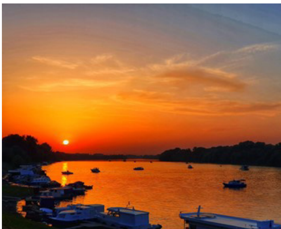
Figure 7 : "Ljeto na Savi"

When looking for socio-petal spaces that work according to peace logics, we turned to Ficibajr, a leisure area along the Sava river, yet close to the city centre (fig. 7). Ficibajr includes a promenade stretching along the river, sports fields, fitness amenities, benches, tables and a piece of forest. One goes to Ficibajr in order to do physical exercise, to celebrate friendship and love, to find some time for reflection and to connect with nature. Specific days to go to Ficibajr are not determined by war commemorations but by other celebrations, in particular Labor Day (1st of May). The users of the area are diverse in terms of ethnonationalist identities, class, gender and age. These observations lead us to arguing that Ficibajr is a socio-petal space that could be said to function as a peacescape on a very local level. More data is required to answer all the questions that we set out with and new ones that arose, but our initial results confirm our intuition that social life in Ficibajr provides an alternative narrative to ethnonationalist peacebuilding in post-war divided cities.