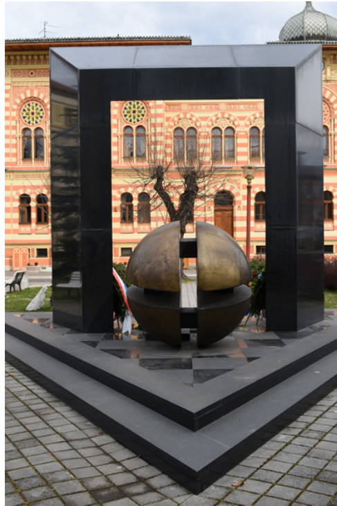
Figure 3: Monument to the "108th HVO Infantry Brigade"; erected in the city center.

5 HVO, paramilitary formation funded by Croatia