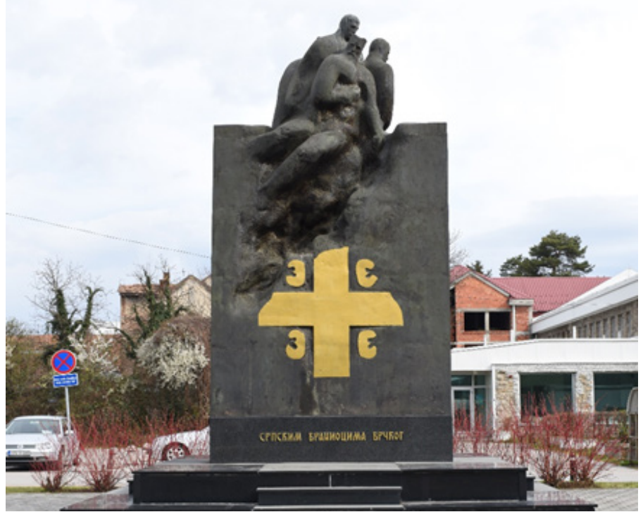
Figure 1: Monument “to the Serb Liberators/Defenders of Brčko”.