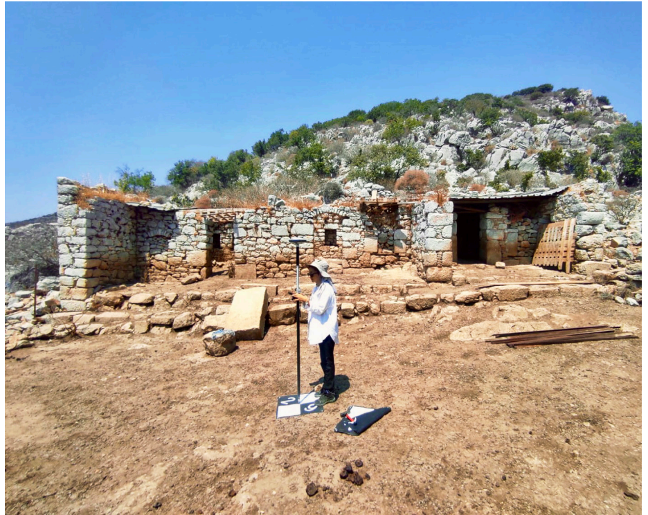
Rural architecture studies, Architect M. Rumeysa Çakan.

that the front yards were used throughout all the buildings, and the number of rooms varied. The study of the materials and construction techniques used in the buildings was also meticulously carried out. We observed that the walls were made of stone and brick fragments reinforced with