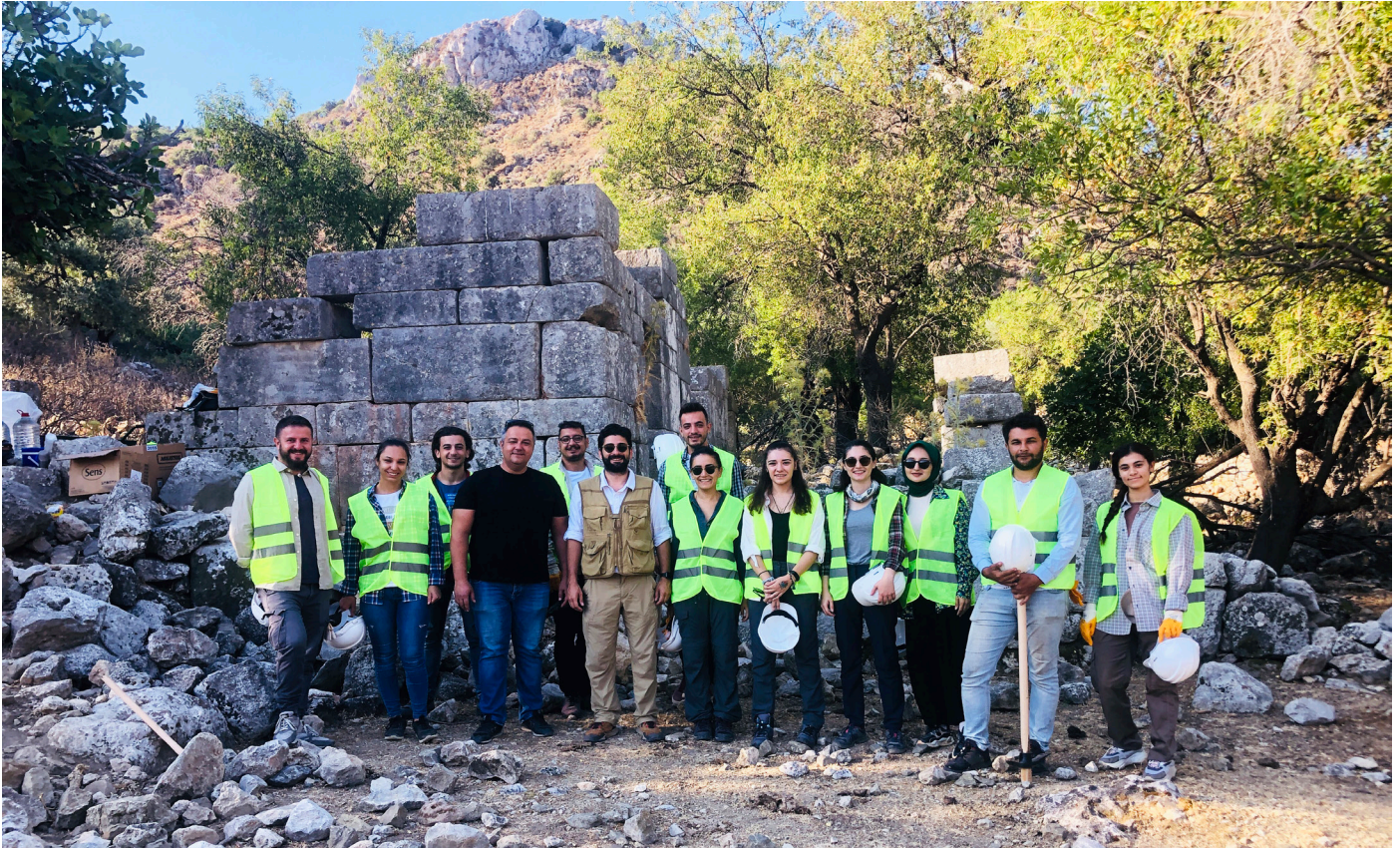
2022, Phoenix team.