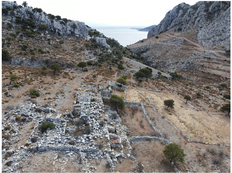
Aerial view of Gedik.

During our field survey at Çakallık Tepesi, located on the modern road leading to Serçe Harbor, we obtained various new data with probable burials associated with the city's southern necropolis, olive oil workshops, cisterns, and