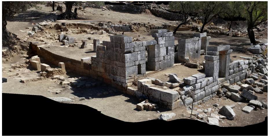
Apollo Sanctuary (Kızlan Church).

cleaning work at regular intervals each year, as we place great importance on showcasing our cultural heritage and providing easy access to the area for visitors. After the cleaning work we carried out in the area, we started excavations in the Kızlan Church which is located inside the Apollo Sanctuary. We adopted the Locus-Lot* system, a proven method for field archaeologists to organize