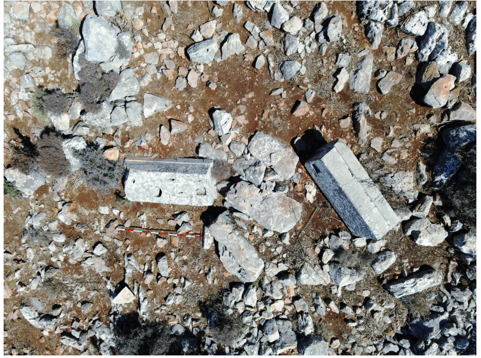
Çakallık Tepesi, stepped tomb stones.