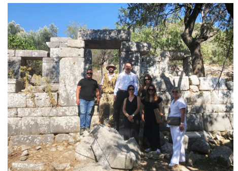
Marmaris Chamber of Commerce visit.