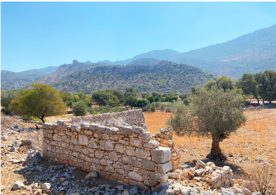
Yukarı Fenaket.

After completing the fieldwork around the ruins of Aşağı Fenaket, we continued our investigations in another neighborhood, Yukarı Fenaket (Phoinikoudi), which was