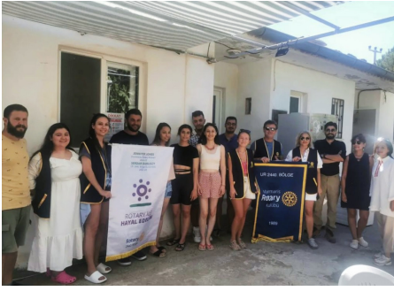
Marmaris Rotary Club visit.