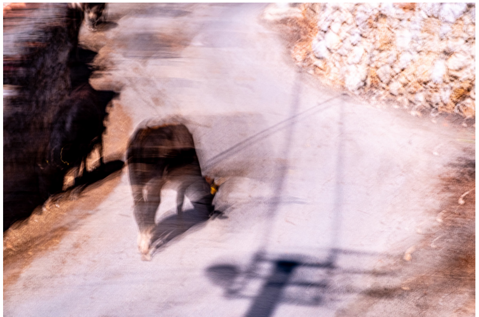
Untitled.