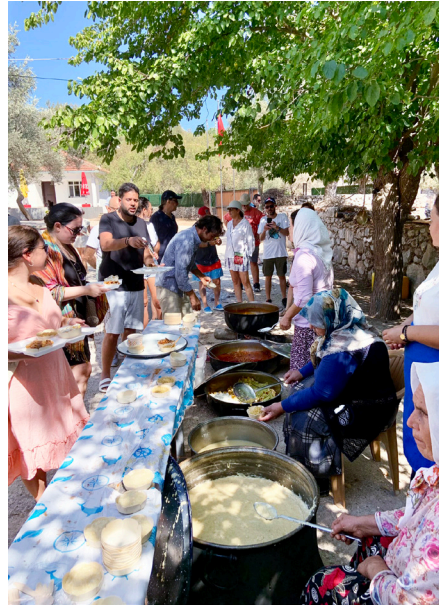
'Hundred years ago - hundred years later' gastronomy event.

In addition to the scientific fieldwork carried out as part of the Phoenix Archaeological Project, cultural heritage studies are being conducted to make a tangible contribution to raising awareness in the region. As part of our project, which is carried out in close collaboration with the residents of Taşlıca, the local community was given a tour of ancient Phoenix and seminars were held to present our work in progress. In addition to these seminars, archaeology clubs were established in schools in cooperation with the Marmaris District National Education Directorate to raise awareness of cultural heritage among students, and visits were arranged to Marmaris Museum and