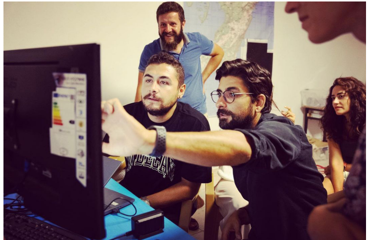
PAP office studies

2022 with all its sub-programs, including archaeological excavations and surface research, was extremely fruitful with the entire team displaying the same determination and excitement as in the first day. During the fieldwork, which took place between July 5 and September 30, we carried out projects in the fields of archaeology, history, ecology, cultural heritage, architecture, gastronomy, contemporary art, and social responsibility, as in the previous year, with a team from various disciplines using new generation approaches.