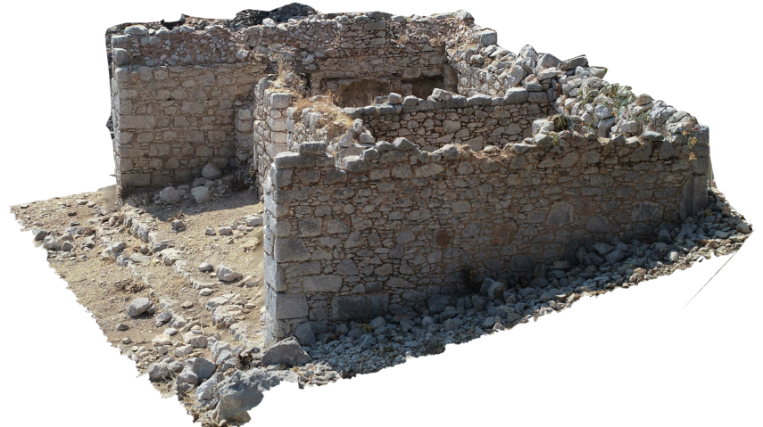
Aşağı Fenaket.