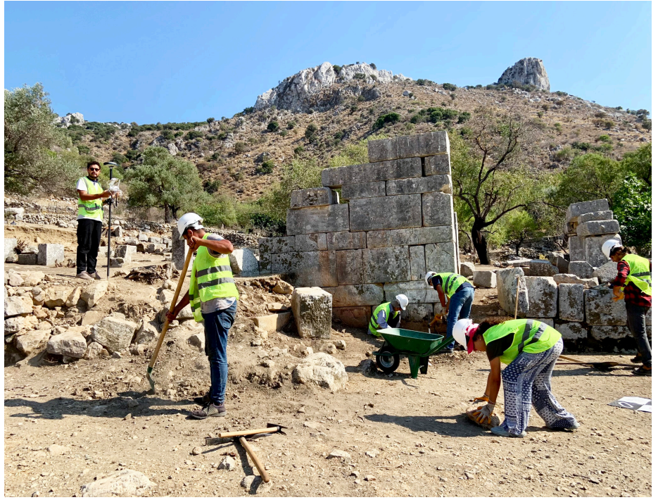
Excavation and landscaping.

*According to the Locus-Lot system, the area where the structure is located is defined as the main excavation area or operation area. Within this main area, if there is any spatial, soil condition, or data-based change, sub-trenches are designated as separate Loci. All layers excavated within these Loci are divided into Lots in numerical slices starting from the top layer.