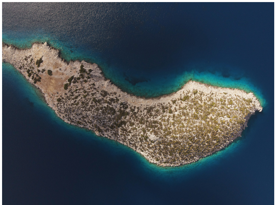
Taşlıca Island top view.