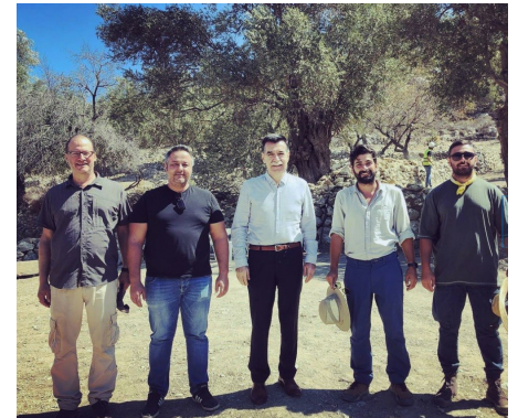
YİKÖB visit.