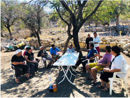
Visit from people of Taşlıca.