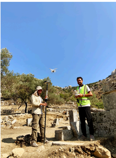
Mapping studies.