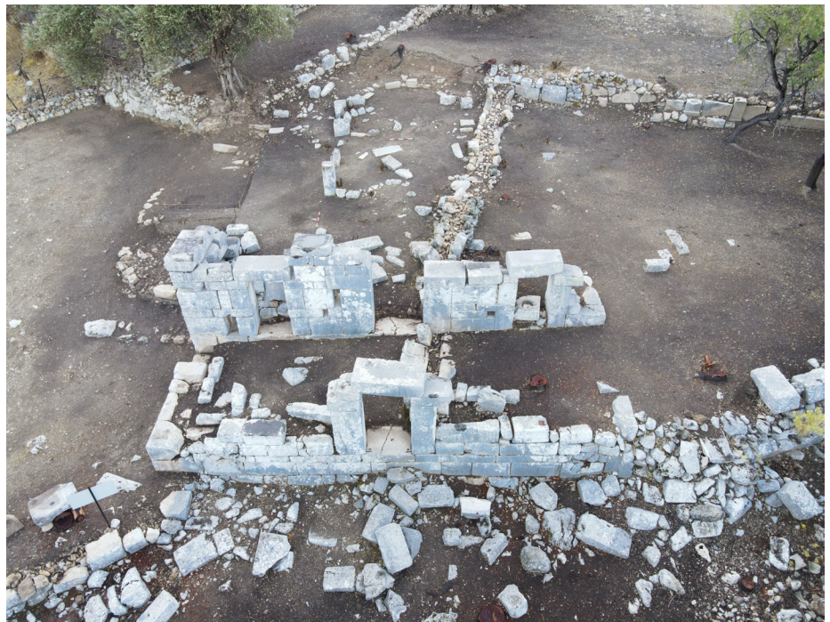
Apollo Sanctuary (Kızlan Church) top view.