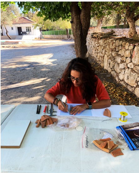
Ceramic documentation by archaeologist Merve Yeşil.

The documentation of the artifacts uncovered during the archaeological excavation and cleaning works were undertaken by experts employed within the scope of the excavation. We conducted these works under five different categories: mapping and orthophoto production, architectural survey, documentation of architectural blocks, documentation of epigraphic data, and ceramic research. In the 2022 season, we uncovered new architectural blocks and completed the technical drawing and photography process of all data. We also produced the technical drawing and documentation of the ceramic data we obtained. In addition to architectural and ceramic findings, we successfully implemented restoration works of small findings