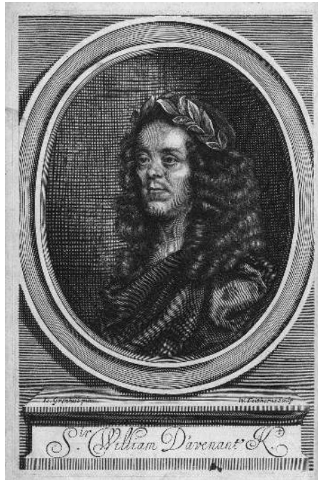
Figure 0.1 Sir William Davenant (1606–1668) by William Faithorne, after John Greenhill, published 1672

Night's Dream , which I had never seen before, nor shall ever again, for it is the most insipid ridiculous play that ever I saw in my life. 6