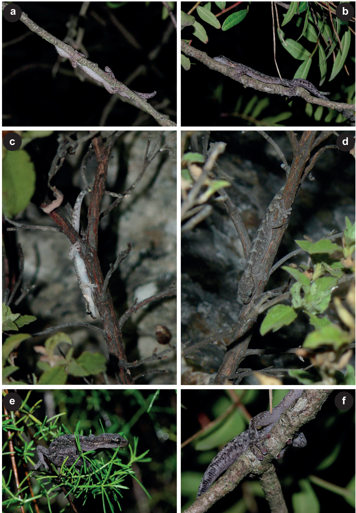
Figure 2. Euleptes europaea on Pistacia lentiscus a, b, f locality Tellaro, Liguria; photo by G. Bruni; on Cistus sp. c, d locality M. Albo, Sardinia; photo by D. Salvi; and on Asparagus aethiopicus e locality Tellaro, Liguria; photo by G. Bruni.