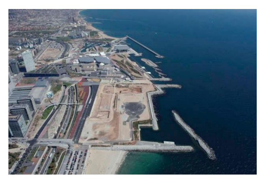
Figure 5. Space Forum Barcelona, 2011.

As for the hybrid form of the new public square, it comes directly from the dialogue to create a symbolic architecture that can adapt to new conditions of competition between global cities, while creating a unique perspective on the new inner city and the waterfront. To do this, planners are working on complementarity between the color of asphalt, architectural forms and the urban furniture. The esplanade of the Forum is the work of José Antonio Martinez Lapeña and Elias Torres. The Insomnia nightclub in the old Poblenou district must create an entertainment company based on electronic music and restore attractiveness to this symbolic place, according to the French architect Jean Nouvel.