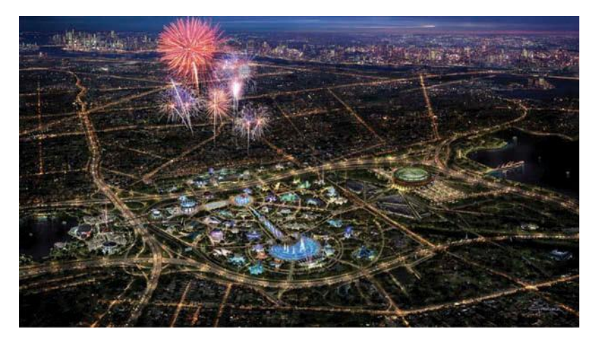
Figure 1. Flushing Meadow World's Fair 2010: 'Stark industries international technologies Exhibition' by the scripwriters of Iron Man 2 .