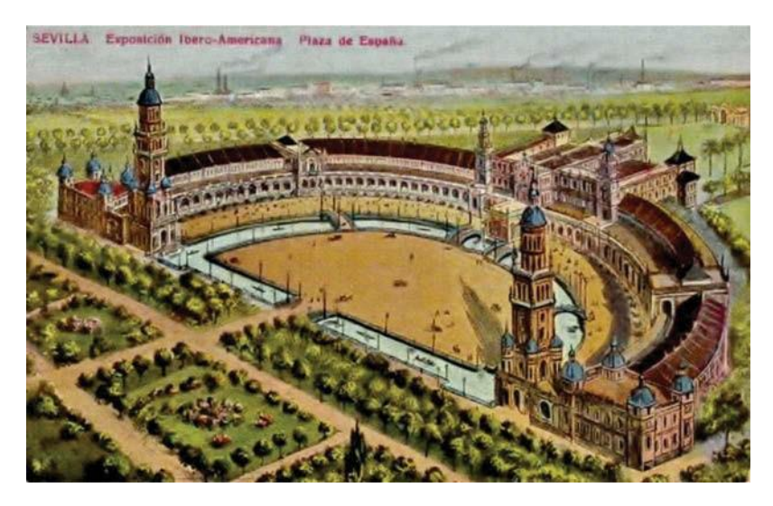
Figure 4. The Plaza de España. Seville 1929. Universal postcard. 1.4 The revival of world expositions: Seville 1992

Despite some international exhibitions such as Saragossa in 1908, it was not until the 1980s that Spain was again interested in the organization of major events in Barcelona and the 1992 Olympics, coupled with the Universal Exhibition in Seville in 1992. The end of the Franco regime allowed Seville to consider a new universal exhibition. However, with the debt burden of Seville 1929, the citizens fear new taxes. Multiple controversies arose about its location and governance (Roulland, 1990, p. 24). The decision was made to repeat the experience by amplifying the scopes, objectives and reasonable boundaries for an average European metropolis. The Municipality makes contact with the BIE in the 1980s. On a new scale for Seville, that of the metropolis, a typical solution of large modern European development projects was applied, namely the creation of a limited company with public capital and the division of Cartuja island into four areas: recreational, cultural, administrations and services. Post-exhibition, the balance sheet is a semi-failure for the new district reconverted in ICT, congress hall and leisure park. The words of the famous city planner Joan Busquets (2001, p.123, author's translation) show the disenchantment of some of the local elites with the project: