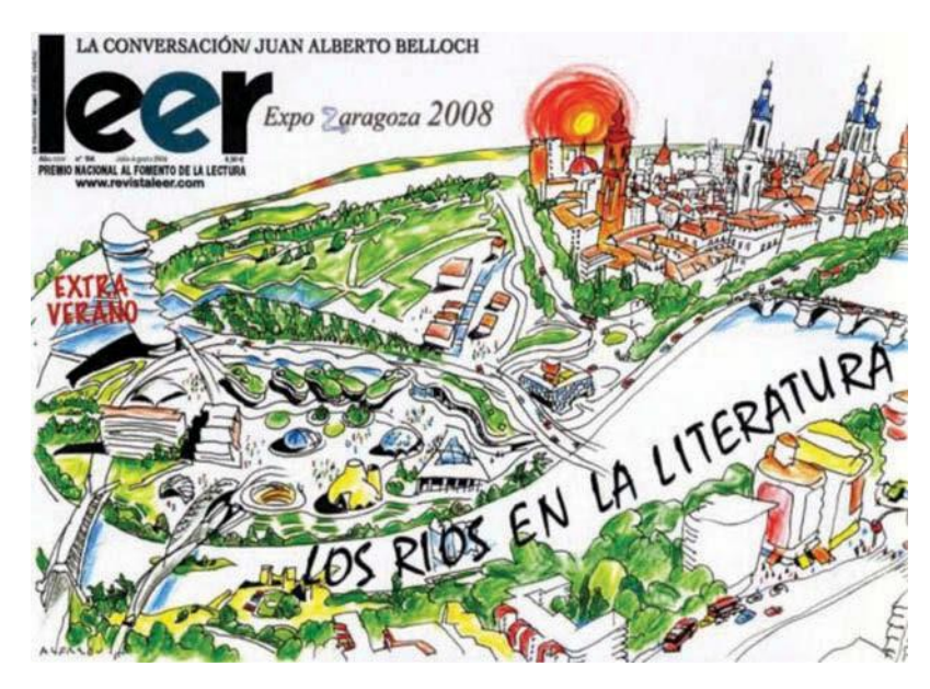
Figure 6. A city and its river. Cover of Leer magazine, 2008, Expo Agua Zaragoza, Rivers in Literature.

The originality rests upon a hydraulic system dividing the Park, about 5 km long, into three bands while providing a main tank with a large basin 500 meters long and 20 meters wide located in the eastern part of the park. It allows the new district in the east of the city to enjoy the variety of regional species. A major point and sign of rupture in the history of the exhibition is that, during the accompanying process of the exhibition leisure area, the organizers decided to pay more than the amount allocated throughout its implementation (Consortium Pro Saragossa, 2004).