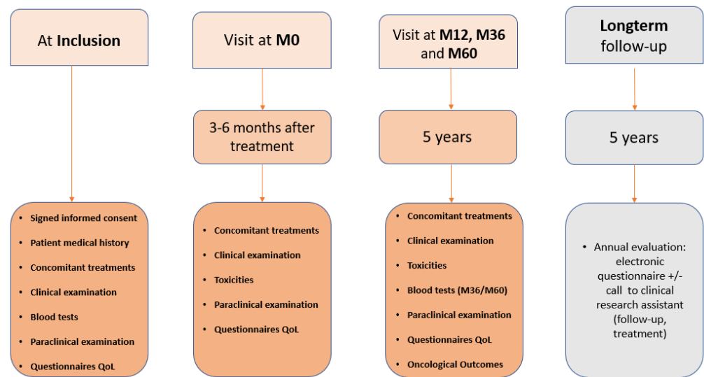
Figure 2. CANTO (Cancer Toxicities) cohort design.