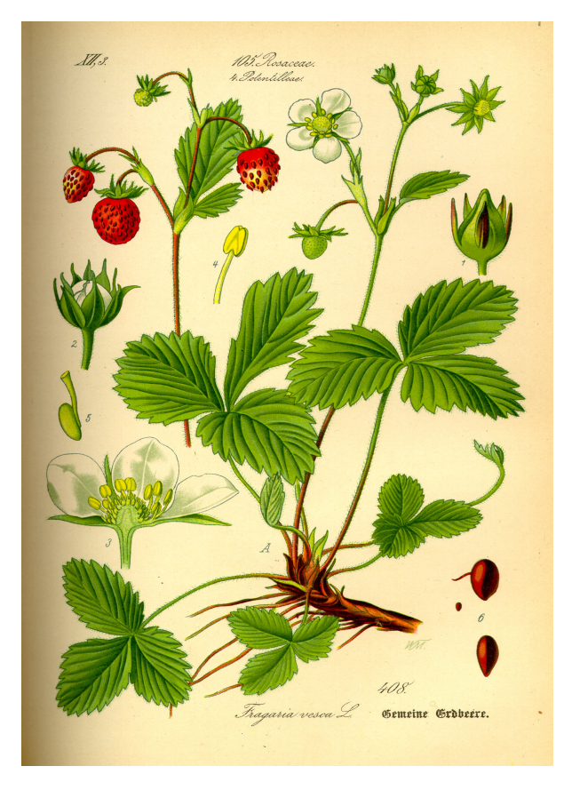
Figure 2: A botanical panel describing Fragaria vesca, the wood strawberry, pictured from the book by Otto Wilhelm Thomé Flora von Deutschland, Österreich und der Schweiz 1885, Gera, Germany, and used under Creative Commons by wikimedia commons. The species has compound leaves (each leaf consisting of three leaflets). 1,2. Flower bud at two developmental stage. 3. Flower, where petals (white), sepals (green), stamens (yellow) and pistils are visible. 4. Stamen. 5. Pistil. 6. The strawberry "fruit" consists of the expanded flower receptacle, the actual fruits (in a botanical sense) being the seeds attached to the surface of this receptacle.

character. In this article we illustrate this way of taking care of neophytes by showing two botanical panels and refering to them when using a specialised vocabulary. The first one, strawberry, illustrate standard terms, with flowers, petals, sepals, stamen, pistil, fruits. The second one illustrates a specialised inflorescence composed of flowers that lack perianth (petals or sepals).