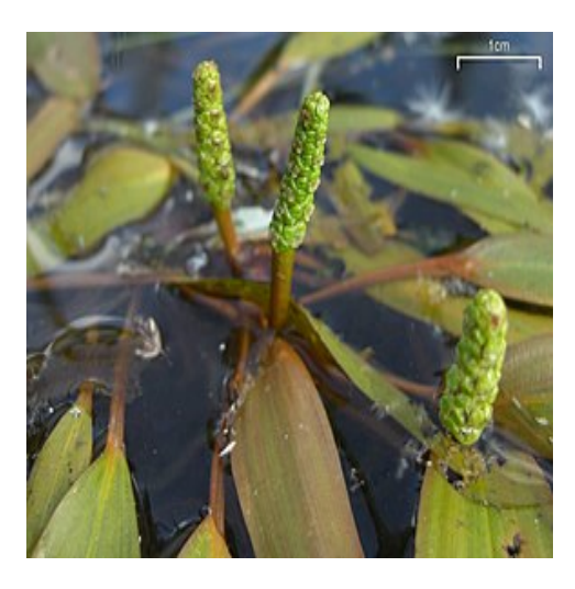
Figure 1: Potamogeton gramineus

A description is a list of properties that should be observable without too much technological involvement (e.g. the leaf is directly attached