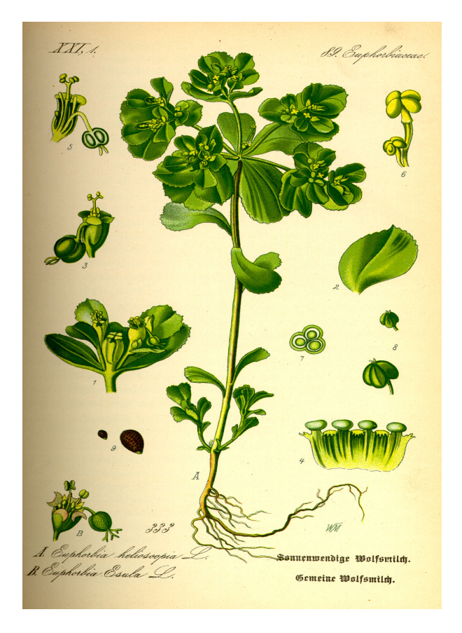
Figure 3: Botanical panel of Euphorbia helioscopia (A) and Euphorbia esula (B), from the same source as Figure 2, under Creative Common licence. 1. Compound inflorescence, showing three cyathia (see 3). 2. Outer inflorescence bract. 3. What appears to be a flower is actually a compact inflorescence, called "cyathium", consisting of flowers that are highly reduced to one pistil or one stamen (5 is a cross-section). 4. Dissected involucre, consisting of fused bracts surrounding the flowers in the cyathium. 6. Male flowers, each consisting of one stamen. 7,8. Female flower consisting of one pistil (7. a horizontal cross-section of the ovary.) 9. Seed.

Another challenge is that from the example description above it is obvious that this transformation is not immediate. For example, there are several kinds of leaves, some submerged, some floating. This polymorphism (several forms for a single subject) is frequent also for non aquatic herbs, with different basal (attached to the ground part of the plant) and caulinar (attached to the aerian part of the stem) leaves. The range of quantitative traits is unprecise, "more or less reduced to phyllodes" is hardly formalized.