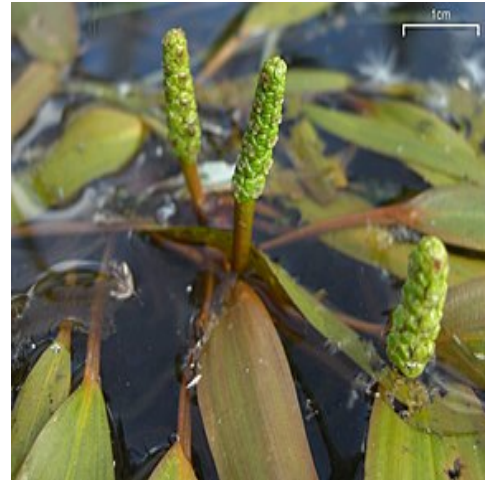
Figure 1: Potamogeton gramineus

A description is a list of properties that should be observable without too much technological involvement (e.g. the leaf is directly attached