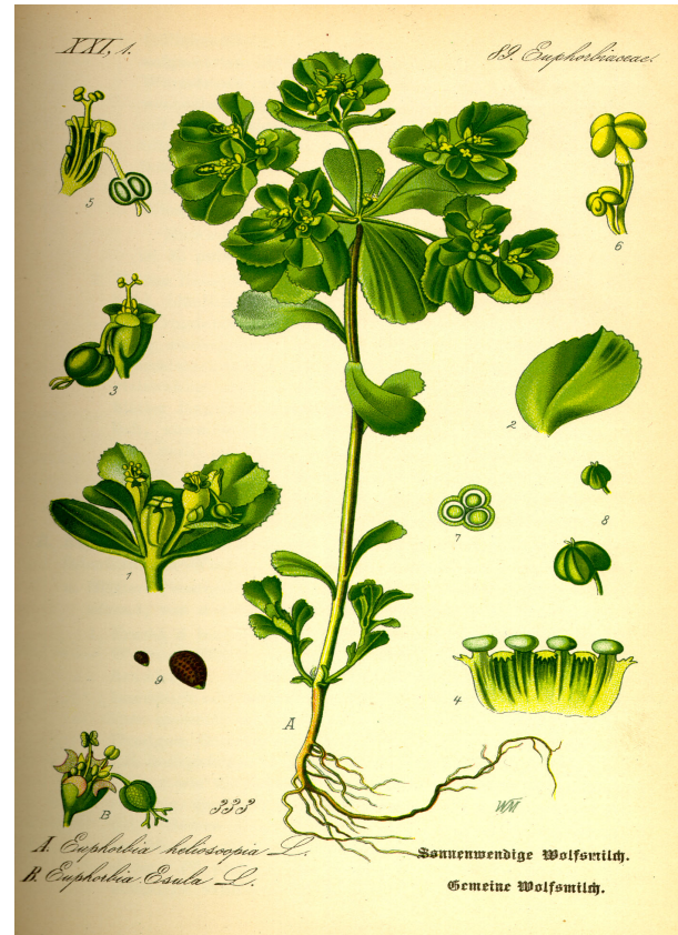
Figure 3: Botanical panel of Euphorbia helioscopia (A) and Euphorbia esula (B), from the same source as Figure 2, under Creative Common licence. 1. Compound inflorescence, showing three cyathia (see 3). 2. Outer inflorescence bract. 3. What appears to be a flower is actually a compact inflorescence, called “cyathium”, consisting of flowers that are highly reduced to one pistil or one stamen (5 is a cross-section). 4. Dissected involucre, consisting of fused bracts surrounding the flowers in the cyathium. 6. Male flowers, each consisting of one stamen. 7,8. Female flower consisting of one pistil (7. a horizontal cross-section of the ovary.) 9. Seed.

Another challenge is that from the example description above it is obvious that this transformation is not immediate. For example, there are several kinds of leaves, some submerged, some floating. This polymorphism (several forms for a single subject) is frequent also for non aquatic herbs, with different basal (attached to the ground part of the plant) and caulinar (attached to the acrian part of the stem) leaves. The range of quantitative traits is unprecise, “more or less reduced to phyllodes” is hardly formalized.