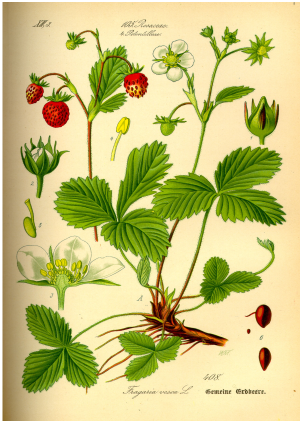
Figure 2: A botanical panel describing Fragaria vesca , the wood strawberry, pictured from the book by Otto Wilhelm Thomé Flora von Deutschland, Österreich und der Schweiz 1885, Gera, Germany, and used under Creative Commons by wikimedia commons. The species has compound leaves (each leaf consisting of three leaflets). 1,2. Flower bud at two developmental stage. 3. Flower, where petals (white), sepals (green), stamens (yellow) and pistils are visible. 4. Stamen. 5. Pistil. 6. The strawberry “fruit” consists of the expanded flower receptacle, the actual fruits (in a botanical sense) being the seeds attached to the surface of this receptacle.

character. In this article we illustrate this way of taking care of neophytes by showing two botanical panels and referring to them when using a specialised vocabulary. The first one, strawberry, illustrates standard terms, with flowers, petals, sepals, stamen, pistil, fruits. The second one illustrates a specialised inflorescence composed of flowers that lack perianth (petals or sepals).