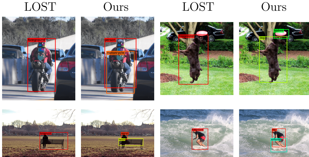
Figure 1: Our approach leverages language from captions via ALBEF to annotate multiple objects per image (e.g. we detect a dog and a frisbee while LOST generates a single categoryless bounding box).

encoder seem to implicitly learn a more fine-grained word-region alignment without using additional supervision [19]. We propose to use the location ability of VL models to automatically annotate objects of interest mentioned in captions. Moreover, VL models do not require retraining when the number of categories to annotate changes as they are already included in the VL model’s vocabulary.