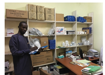
Photo: Data collection at the clinique Halles de Bamako, October 2019, Mali