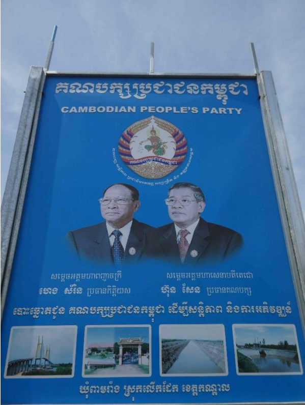
Electoral poster along national road 21