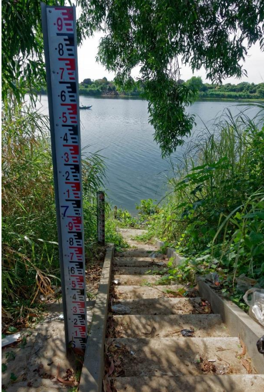
Gauging station in Koh Khel (Sylvain Massuel)