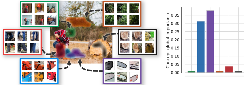
Fig. 5. Illustration from Fel et al. [35]. Natural examples in the colored boxes define a concept. Purple box: could define the concept of "chainsaw". Blue box: could define the concept of "saw's motor". Red box: could define the concept of "jeans".

Like in part-based XAI, the first concept-based method used labeled concepts. Kim et al. [66] introduced concept activation vectors (CAV) to represent concepts using a model latent space representation of images. Then, they design a post-hoc method, TCAV [66] based on CAV to evaluate an image correspondence to a given concept. Even though it seems promising, this method requires prior knowledge of the relevant concepts, along with a labeled dataset of the associated concepts, which is costly and prone to human biases.