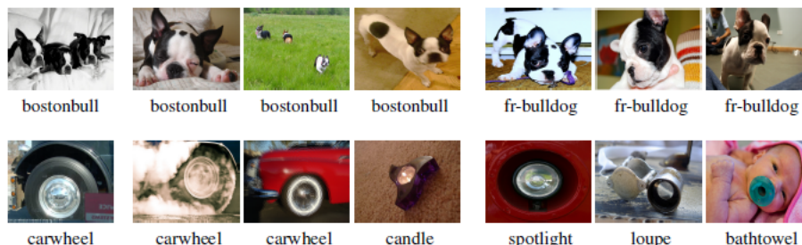
Fig. 3. Figure taken from F. Liu [93]: A tracing process for estimating influence, TracIn, applied on ImageNet. The first column is composed of the test sample, the next three columns display the training examples that have the most positive value of influence score while the last three columns point out the training examples with the most negative values of influence score. (fr-bulldog: french-bulldog)

Influential techniques can provide both global and local explanations to enhance model performance. Global explanations allow for the identification of training samples that significantly shape decision boundaries or outliers (see Fig. 1), aiding in data curation. On the other hand, local explanations offer guidance for altering the model in a desired way (see Fig. 3). Although they have been compared to similar examples and have been shown to be more relevant to the model [46], they are more challenging to interpret and their effectiveness for trustworthiness is unclear. Further research, particularly user studies, is necessary to determine their ability to take advantage of human cognitive processes.