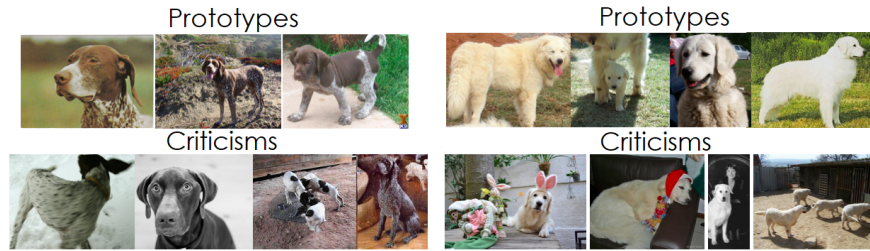
Fig. 4. Figure taken from [64]: Learned prototypes and criticisms from Imagenet dataset (two types of dog breeds)

Fig. 4 shows examples of prototypes and criticisms from Imagenet dataset. Prototypes and criticism can be used to add data-centric interpretability, post-hoc interpretability, and to build an interpretable model [82]. The data-centric approaches will be very briefly introduced.