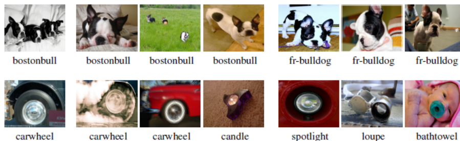
Fig. 3. Figure taken from F. Liu [93]: A tracing process for estimating influence, TracIn, applied on ImageNet. The first column is composed of the test sample, the next three columns display the training examples that have the most positive value of influence score while the last three columns point out the training examples with the most negative values of influence score. (fr-bulldog: french-bulldog)

Influential techniques can provide both global and local explanations to enhance model performance. Global explanations allow for the identification of training samples that significantly shape decision boundaries or outliers (see Fig. 1), aiding in data curation. On the other hand, local explanations offer guidance for altering the model in a desired way (see Fig. 3). Although they have been compared to similar examples and have been shown to be more relevant to the model [46], they are more challenging to interpret and their effectiveness for trustworthiness is unclear. Further research, particularly user studies, is necessary to determine their ability to take advantage of human cognitive processes.