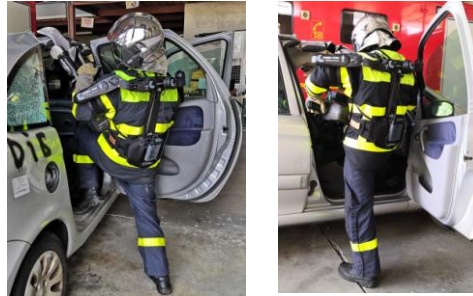
Figure 1: Firefighters equipped with the MATE exoskeleton performing a vehicle extrication maneuver.

committee COERLE, and was conducted in accordance to the Declaration of Helsinki.