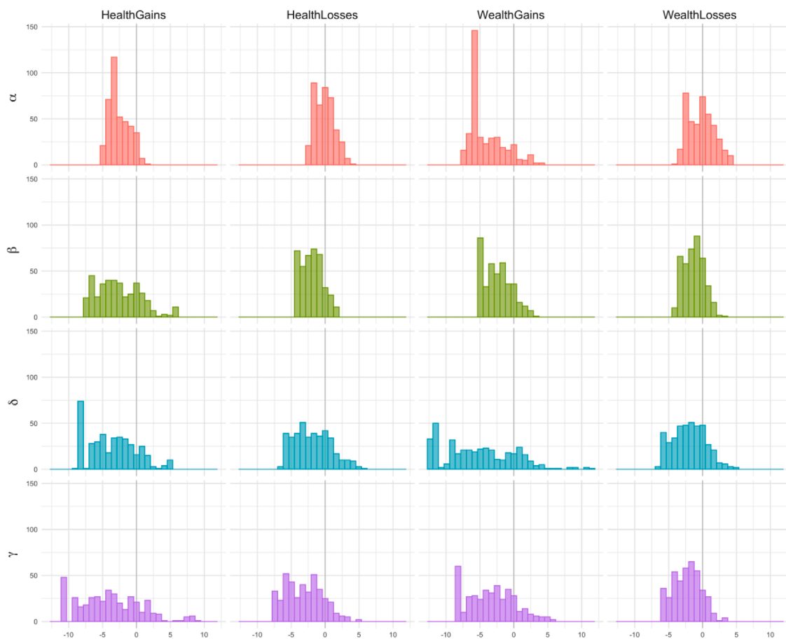
Fig. 3. Distributions of individual random effects.