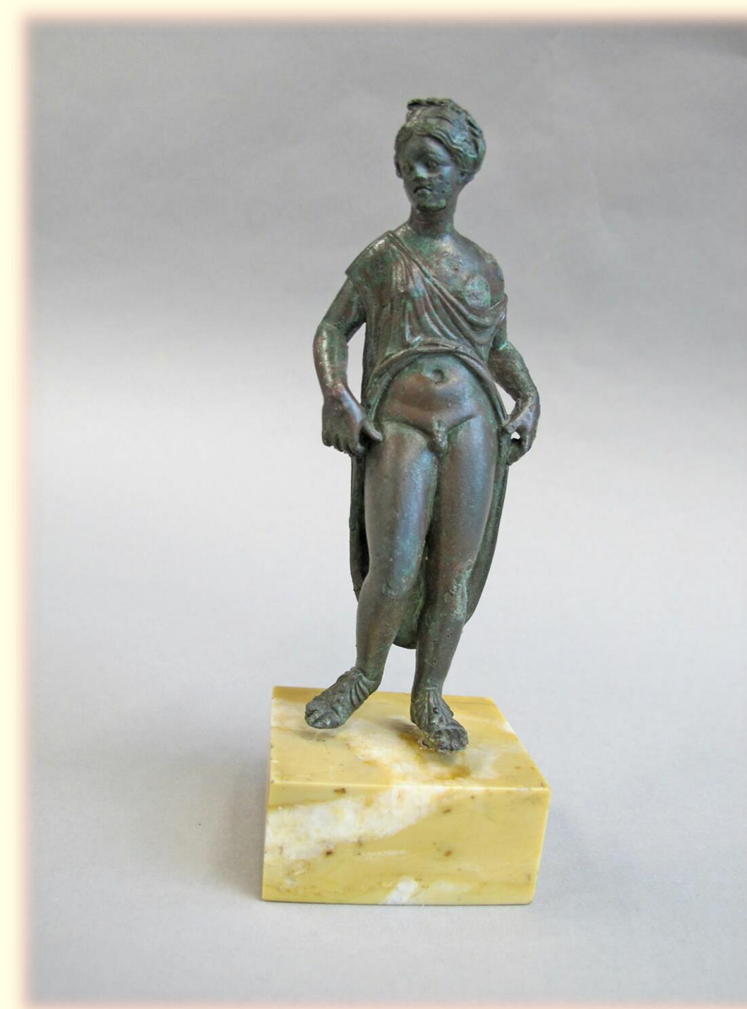
Hermaphroditus Anasyromenos , Musée du Louvre MNC 915 / Br 390