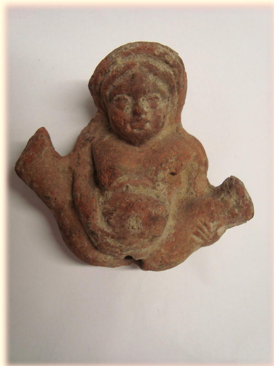
Baubo, Musée du Louvre, NIII 3191 ; N 3191

The Anasyrma is a Mediterranean ritual in which a deity or a person lifts up their robe to expose the genitalia. It can be seen as a fecundity ritual with a double meaning: to wish fertility on someone or something or to receive fertility, usually by gods. Another hypothesis is that, in case this gesture exposes a penis, the Anasyrma is functional against the Evil Eye. In Egyptian mythology and cultic practice there are records of mostly women involved in this ritual: Hathor in Chester Beatty I Papyrus lifts up her robe to make her father Amun laugh; in Esna is recorded a ritual in which on the 29 th day of Athyr, two women expose their genitals and breasts in front of a representation of Hathor to bless the Pharaoh and the land; during the journey made by boat on the river Nile to reach Bubasti for the festival of Artemis (Bastet), some women lifted their vestment to show their genitals in front of villages and fields to bless them with fertility; women lift their robes in front of the Apis Bull to be blessed by his fertility powers; many are the figurines of Isis Anasyromenos dating to Hellenistic Egypt. The only testimonies of an exposed penis are given by the eight Ptolemaic figurines of the god Hermaphroditus found in Lower Egypt. The aim of the research is to understand if in Egypt the Anasyrma has to be seen as either a fertility ritual or an apotropaic one.