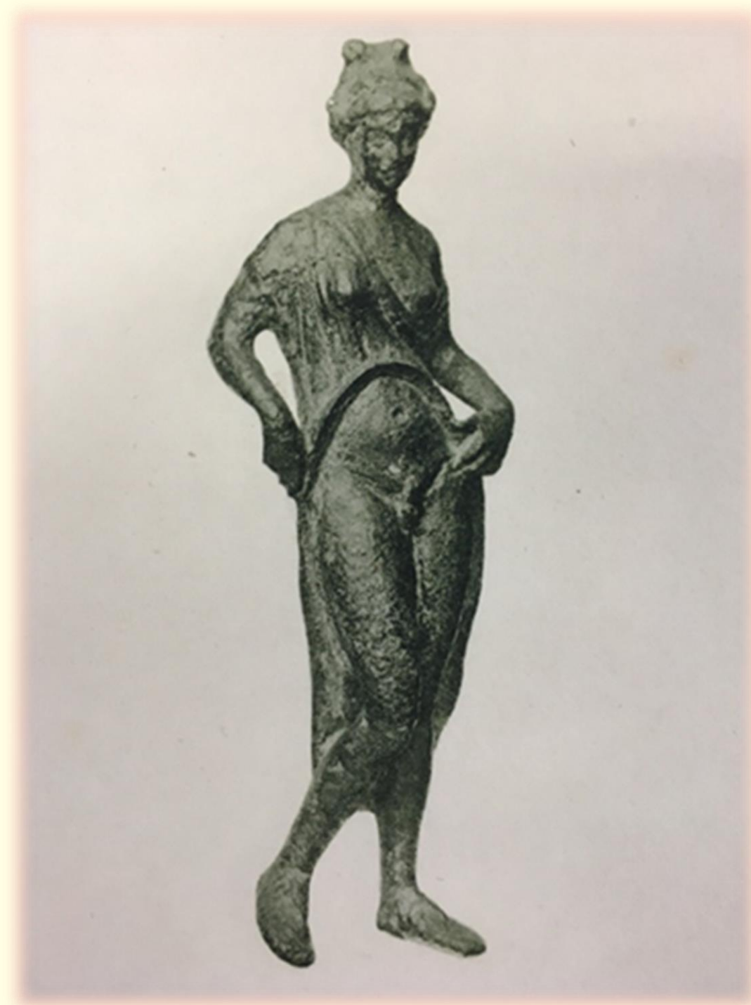
Hermaphroditus Anasyromenos , Perdrizet, 1911, p. 5