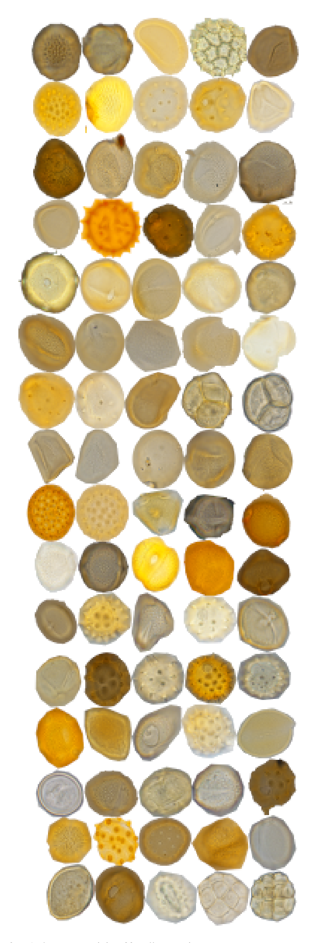
Fig. 3. A dataset containing 80 pollen species.