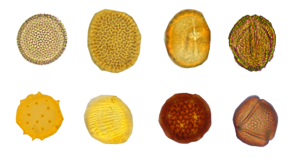
Fig. 5. Example of pollen texture.