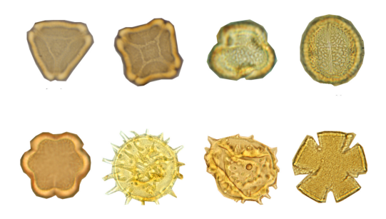
Fig. 4. Example of pollen shapes.