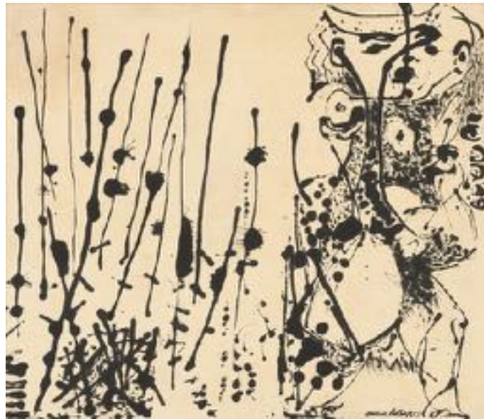
7. Jackson Pollock, Number 7 1951, 143x167cm, enamel on canvas, National Gallery of Art, Washington DC.

think it simple to splash a Pollock out” (Friedman 1995, 174). The paint he uses is more fluid, employing at times a turkey baster, for greater precision while drawing. He can now show that he controls what he is doing while still achieving results as harmonious to his eyes as the abstract works (fig. 7).