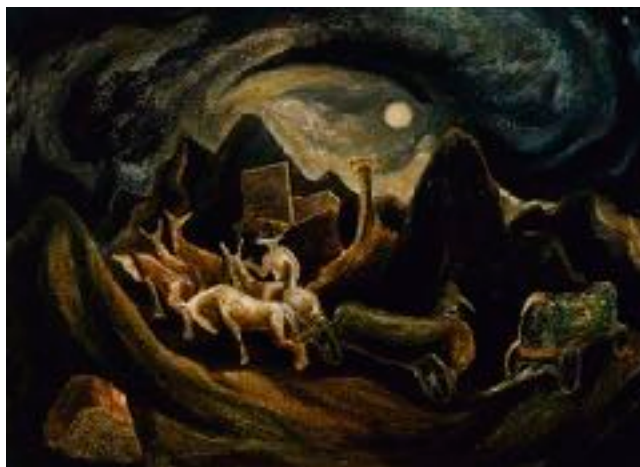
Top: Benton, Chilmark landscape , 1922. Middle: with underlined curves. Bottom: Pollock, ca. 1935, oil on fiberboard, Smithsonian American Art Museum, Washington DC.

lack of figurative elements helps us focus on the presence felt by the artist rather than their mere appearance (as is partly the case for Stenographic figure ). It can thus be said that Pollock is searching for an inner prototype guiding his actions.