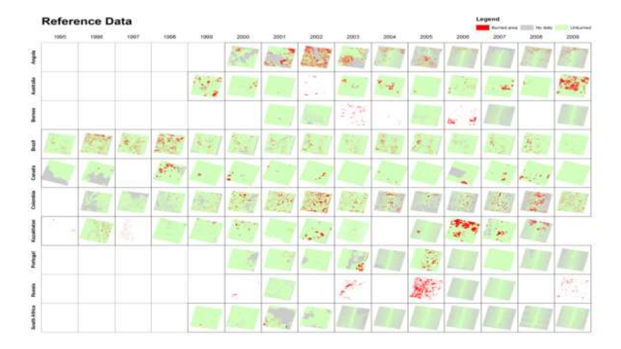
Figure 3: Time series of reference BA areas derived from multitemporal pairs of Landsat TM/ETM+ images for the study sites

adapted to the needs of the climate modelling community, both in terms of specifications and contents. The current status of the project is now focusing on developing the BA and merging algorithms and therefore, there are not yet BA outputs available.