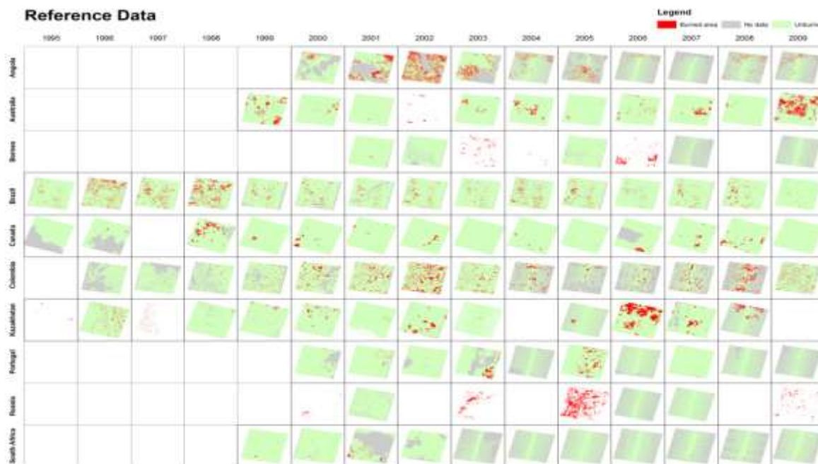
Figure 3: Time series of reference BA areas derived from multitemporal pairs of Landsat TM/ETM+ images for the study sites

adapted to the needs of the climate modelling community, both in terms of specifications and contents. The current status of the project is now focusing on developing the BA and merging algorithms and therefore, there are not yet BA outputs available.