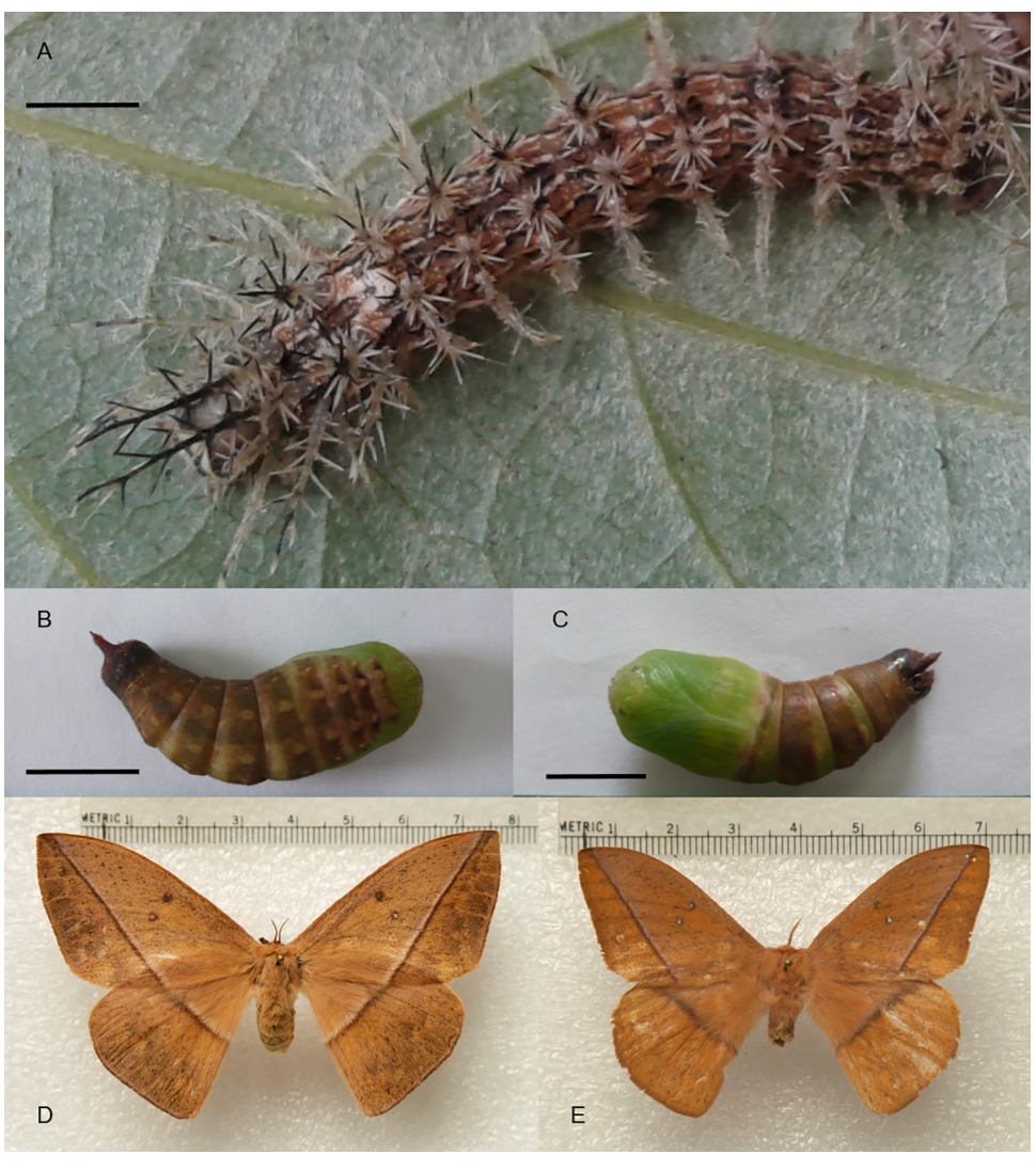
Fig 4. Lonomia casanarensis life cycle. (A) Sixth instar larva. (B) Pupae dorsal view. (C) Pupae ventral view. (J) Female. (K) Male. Bar = 1 cm.

spinneret. Dorsal and ventral sides of the body dark brown. Light brown prolegs. T2 (mesothorax) -T3 (metathorax) with light brown, very thin and weak dorsal lines that converge at the end of T3, forming a conspicuous U. T2 to A1 with a light brown subdorsal line. T1 to T3 have light brown lateral lines. T1-A9 segments with a continuous, thin, light brown subventral line (Fig 1B). Body segments with unbranched scoli, except in T1-T3, which have dorsal and subdorsal scoli bifurcated at the apex and projected above the head, with those of T3 being the longest of the entire body. Scoli in A1-A8 are short and perpendicularly projected from the body axis. A9 with a bifurcated scolus. Dark brown dorsal and subdorsal scoli. Light yellow lateral scoli on the subventral line. T1- A2 and A7- A9 with short, light yellow subventral scoli.