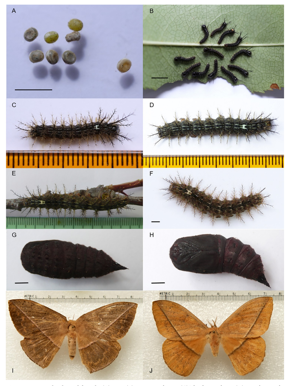
Fig 1. Lonomia columbiana life cycle. (A) Eggs. (B) First instar larvae. (C) Third instar larva. (D) Fourth instar larva. (E) Fifth instar larva. (F) Sixth instar larva. (G) Pupae dorsal view. (H) Pupae ventral view. (I) Female. (J) Male. Bar = 0.5 cm.

some of them had increased abdominal darkening over time. This prevented the movement of their prolegs, making it difficult for them to hold on to plants and ultimately causing them to fall off from the plant. Caterpillars died within two days of beginning to exhibit lethargy. Adult ichneumon wasps emerged 26–28 days after their larvae exited from L. orientocordillera larvae. Lonomia casanarensis parasitoids (S3 Fig) attacked the pupal stage. The parasitized pupa lost weight rapidly and secreted a foul-smelling substance.