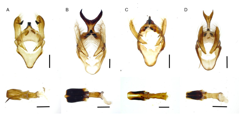
Fig 5. Photographs of male genitalia. (A). Lonomia columbiana , (B). Lonomia orientocordillera , (C). Lonomia orientoandensis , (D). Lonomia casanarensis . Bar = 1 mm.

As described by Lemaire [14], the male genitalia have a simple sclerotized uncus (Fig 5A), valves with multiple strong apical and marginal setae, bearing a subapical inner process shaped as a broad sclerotized brush; gnathos forming a pair of arms forming distal flat and rounded lobes with multiple short setae; aedeagus short, slightly curved (ventrally concave) with its vesica bearing a long strongly sclerotized sword-like cornutus. Sclerites of abdominal segment