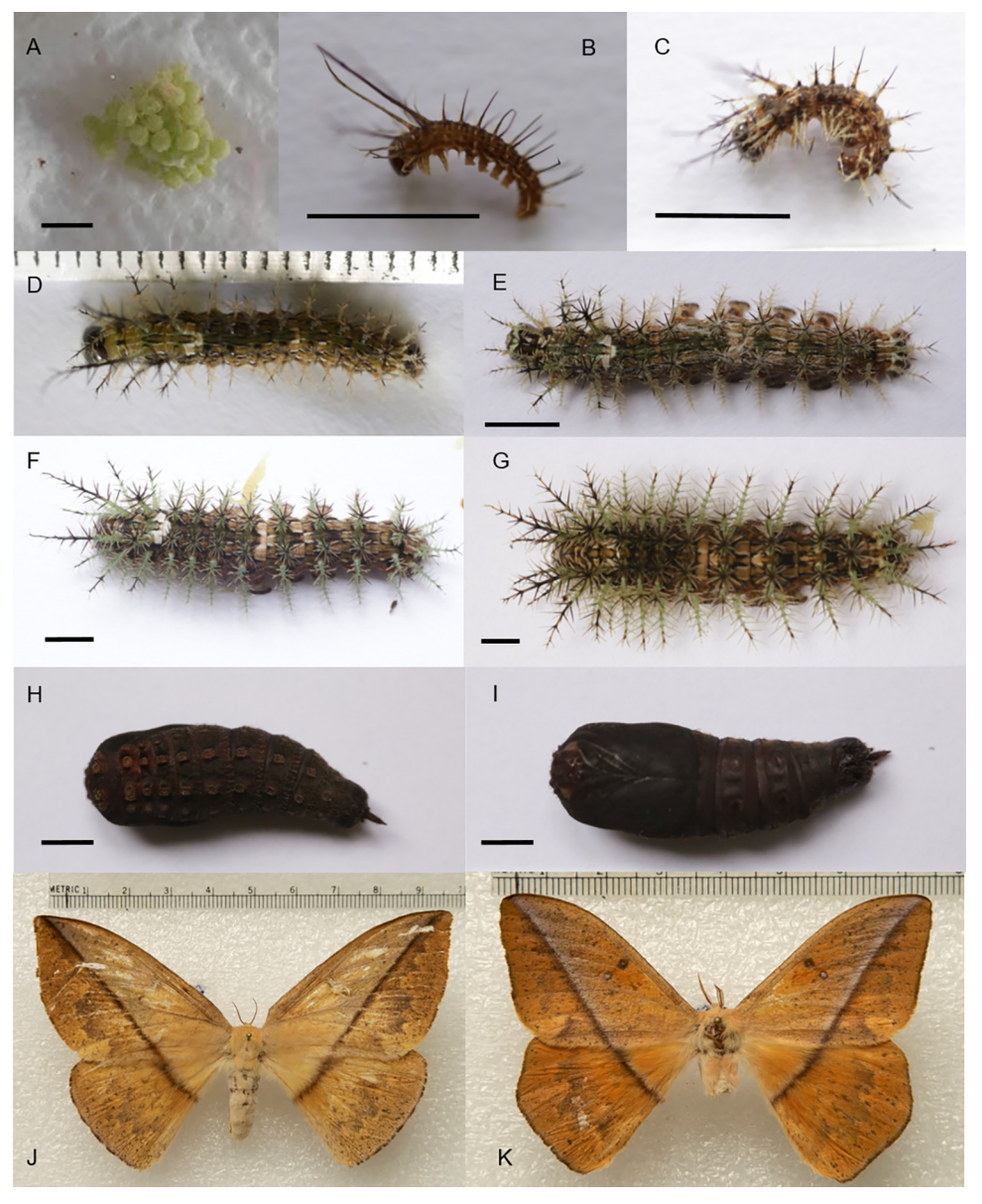
Fig 2. Lonomia orientocordillera life cycle. (A) Eggs. (B) First instar larvae. (C) Second instar. (D) Third instar larva. (E) Fourth instar larva. (F) Fifth instar larva. (G) Sixth instar larva. (H) Pupae dorsal view. (I) Pupae ventral view. (J) Female. (K) Male. Bar = 0.5 cm.